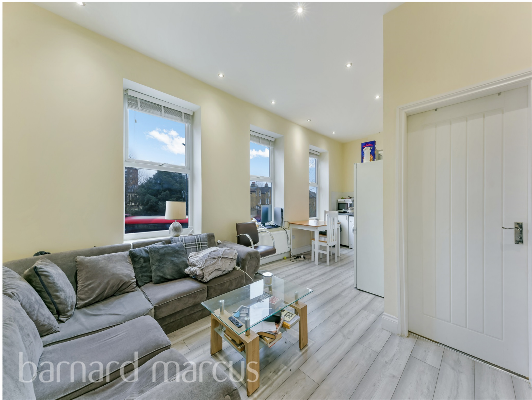
Brixton Hill, London SW2 1HT