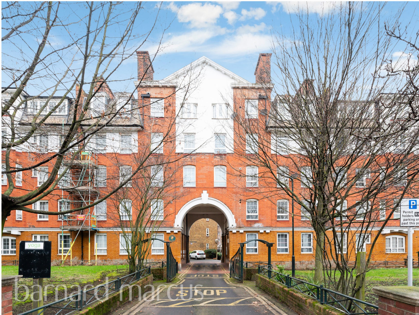
Renton Close Brixton Hill, London SW2 1EY