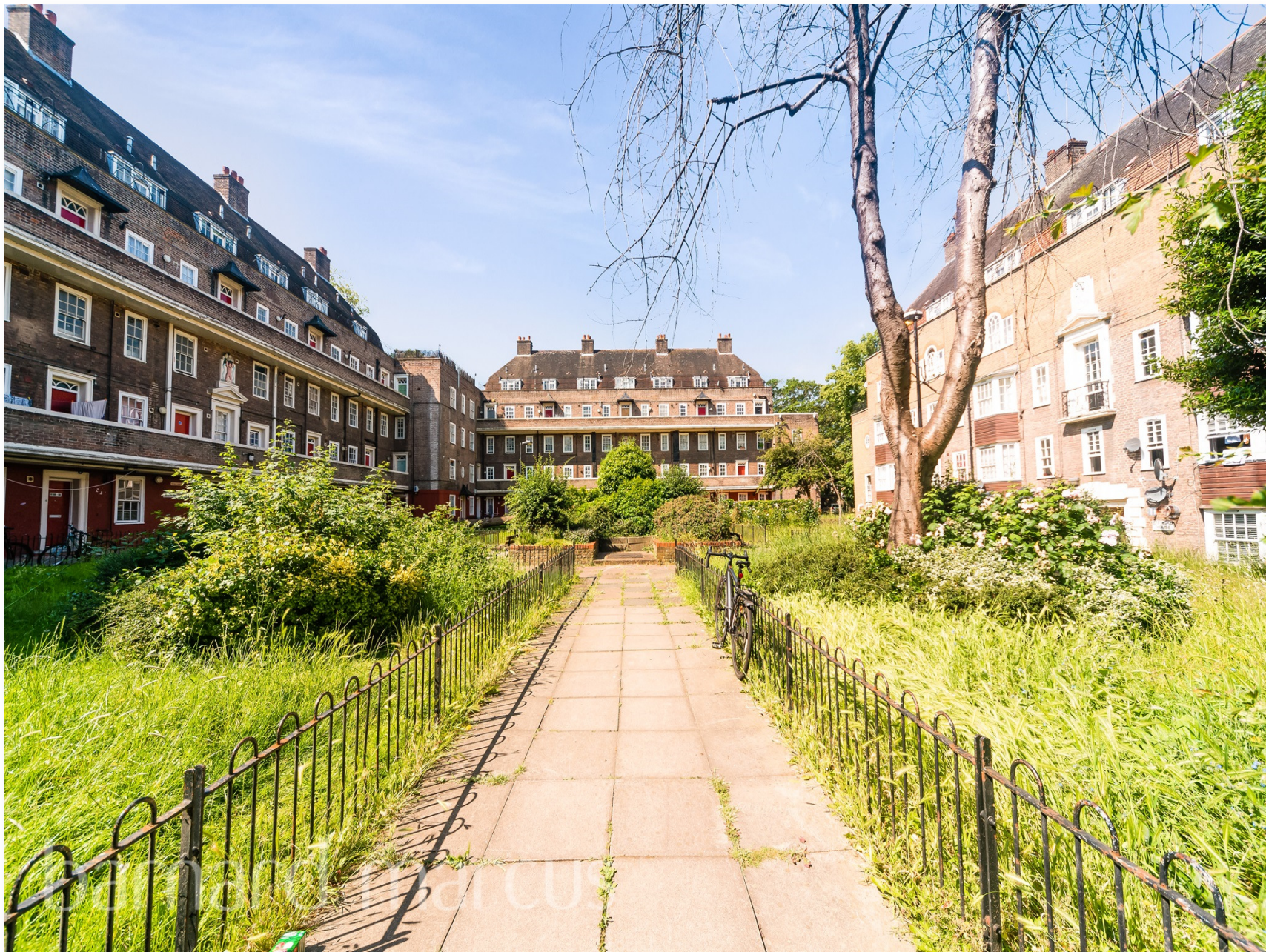
Fraser House Albion Avenue, London SW8 2AR