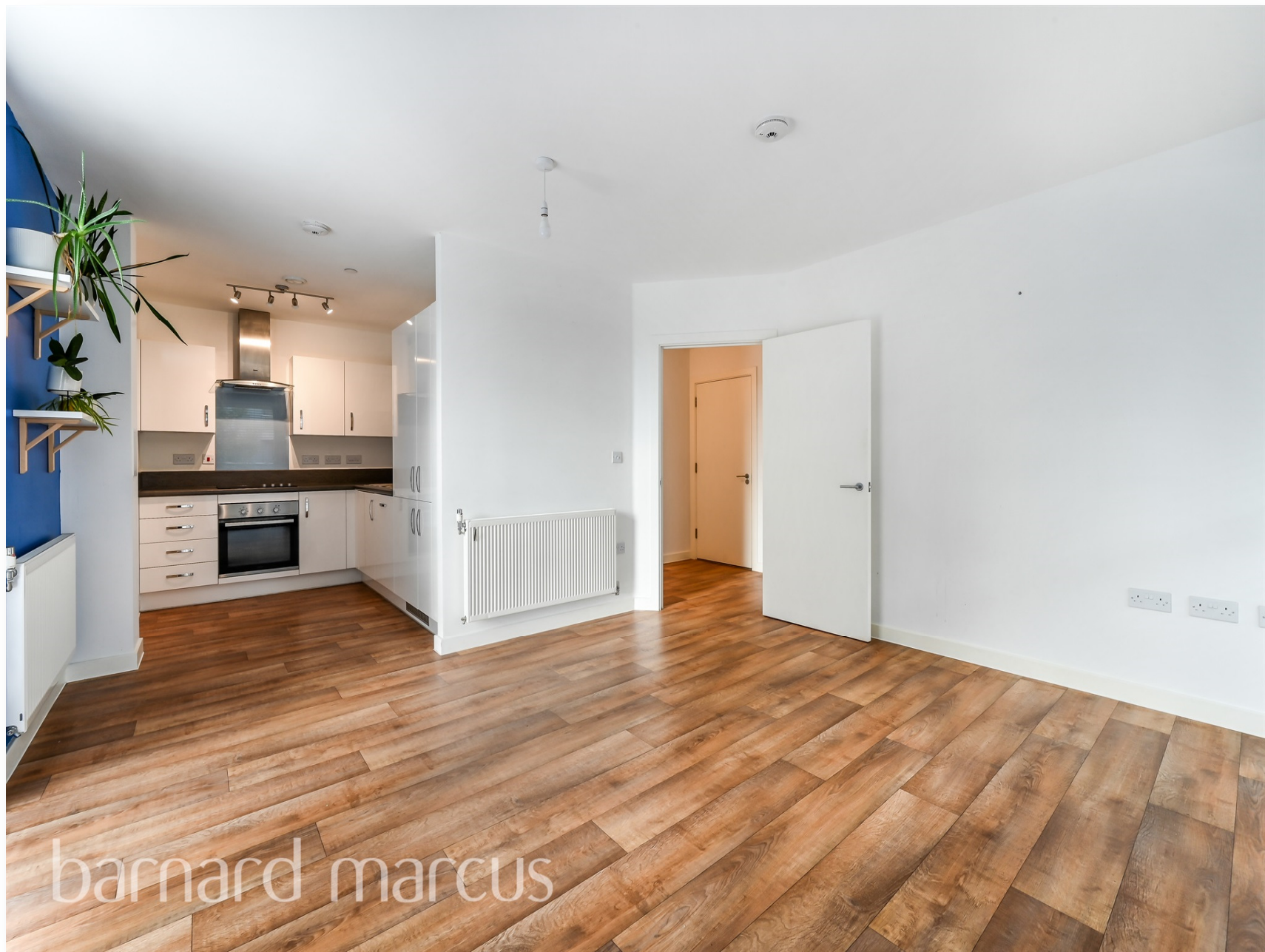
Newsom House Loughborough Park, London SW9 8FU