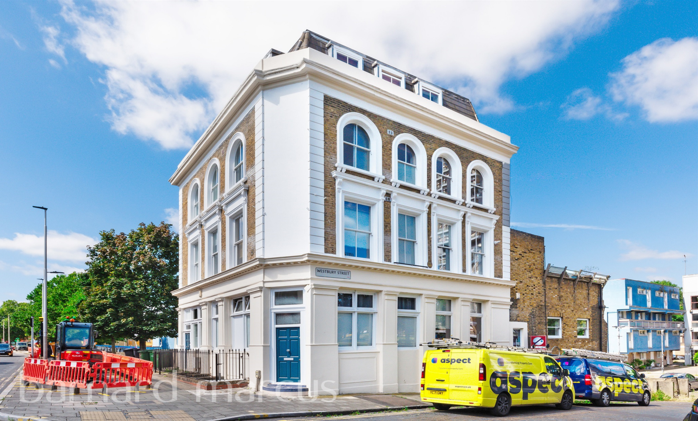
The Westbury Wandsworth Road, London SW8 3ND

Not for marketing purposes INTERNAL USE ONLY