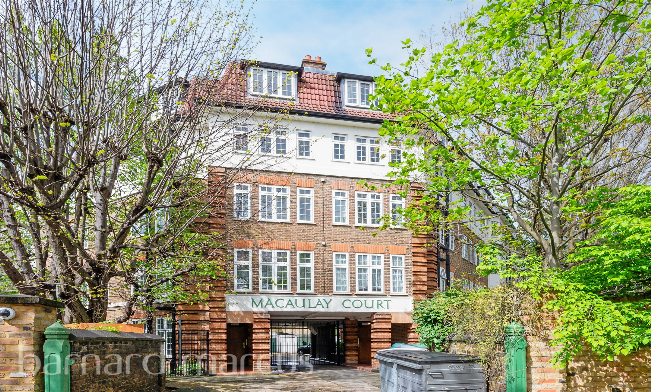
Macaulay Court Macaulay Road, London SW4 0QU