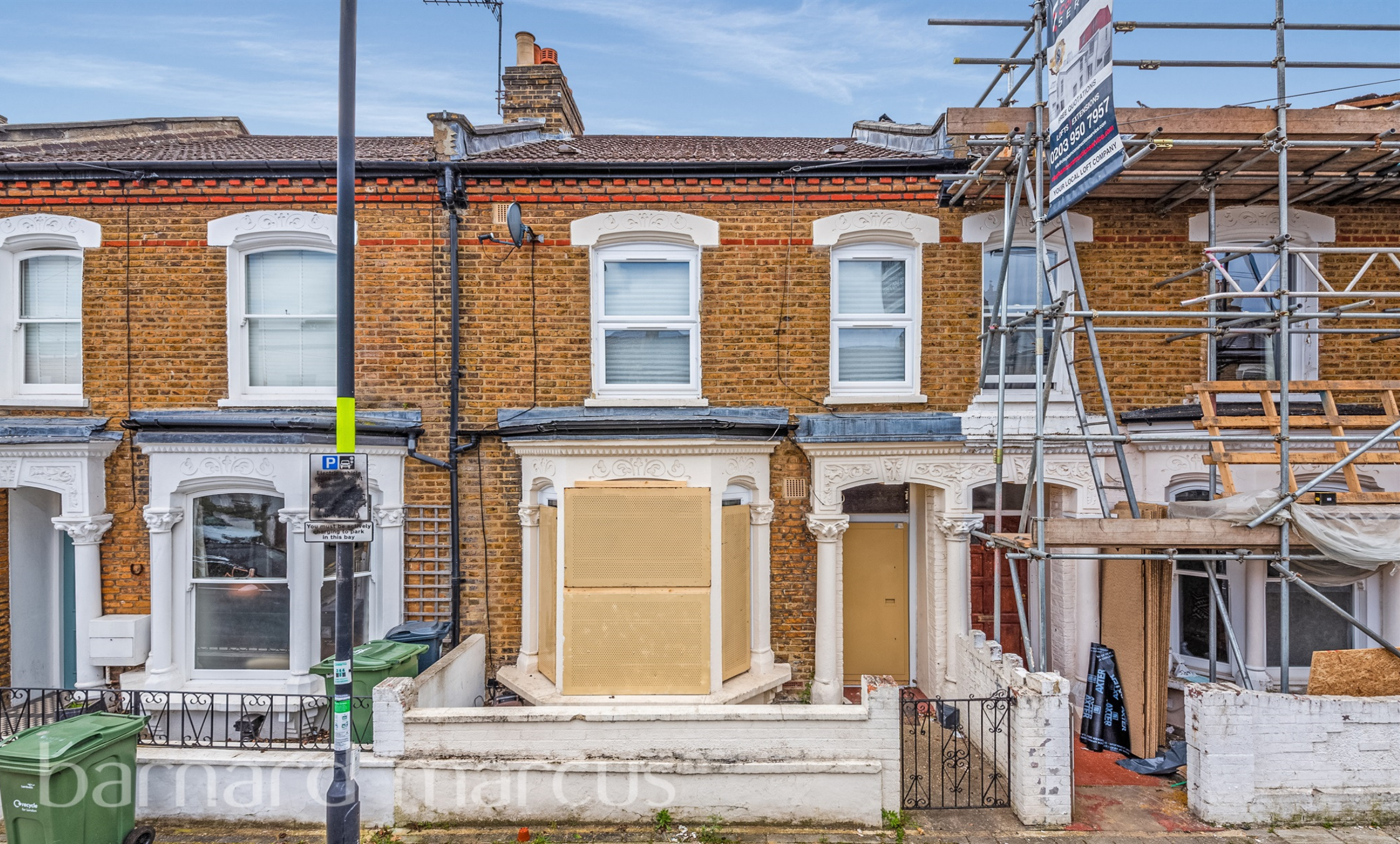
Talma Road, London SW2 1AT