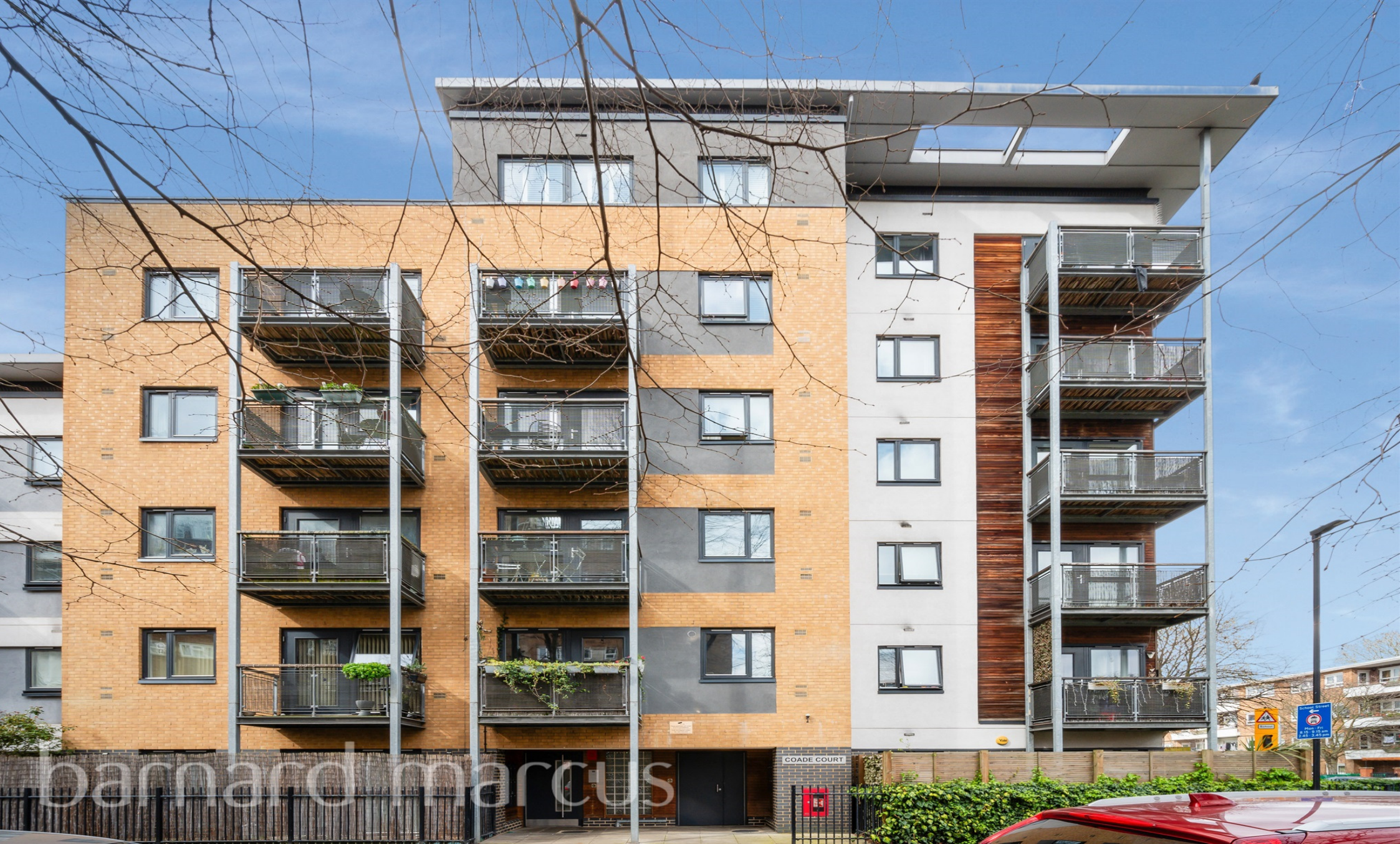
Coade Court Paradise Road, London SW4 6AN

Not for marketing purposes INTERNAL USE ONLY