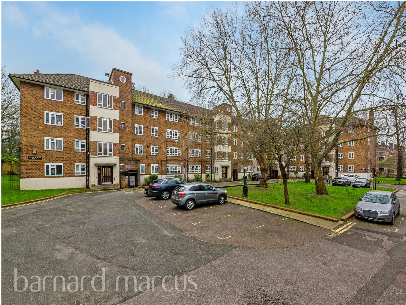
Couchman House Oaklands Estate, London SW4 8NJ