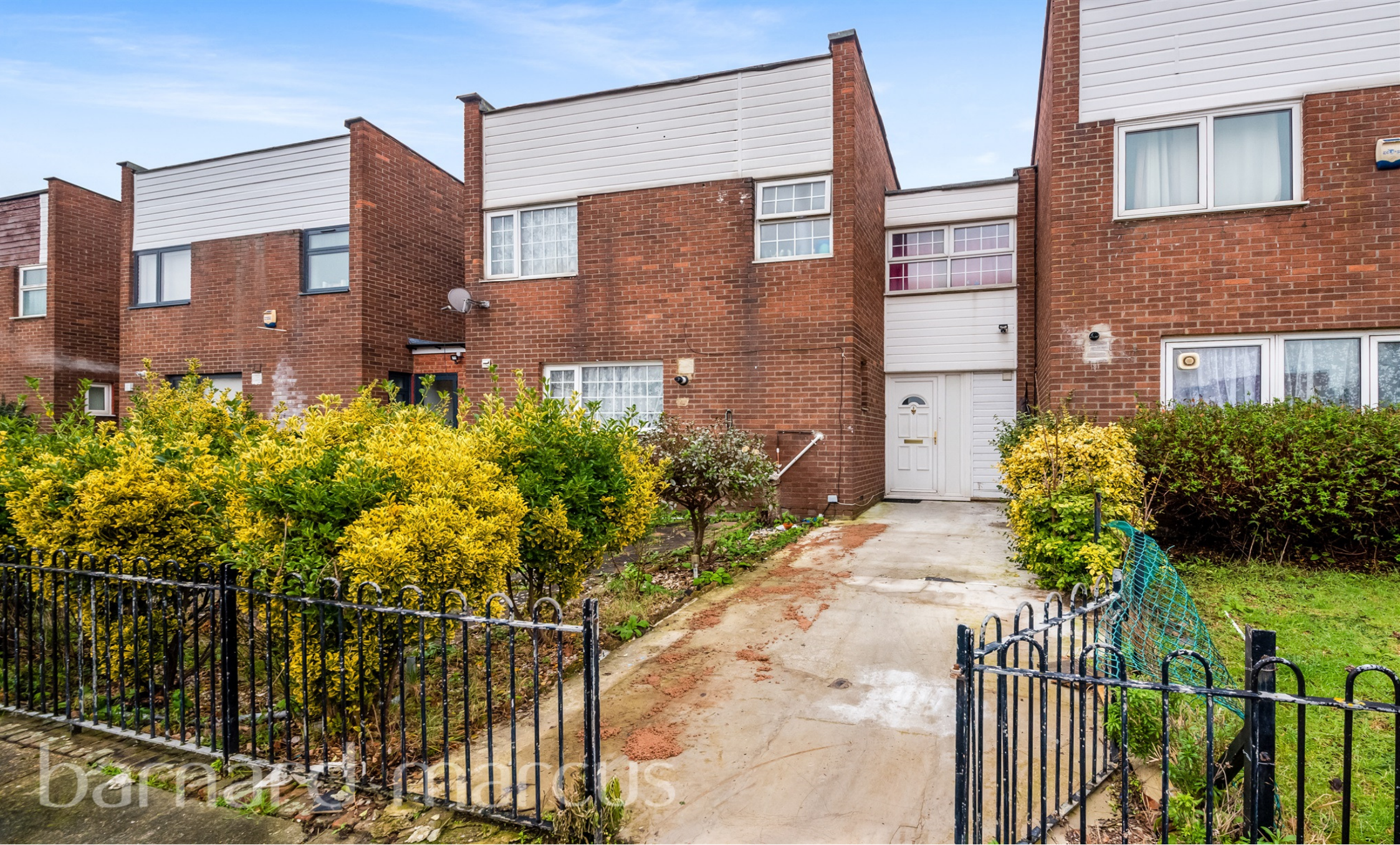
Vibart Gardens, London SW2 3RJ