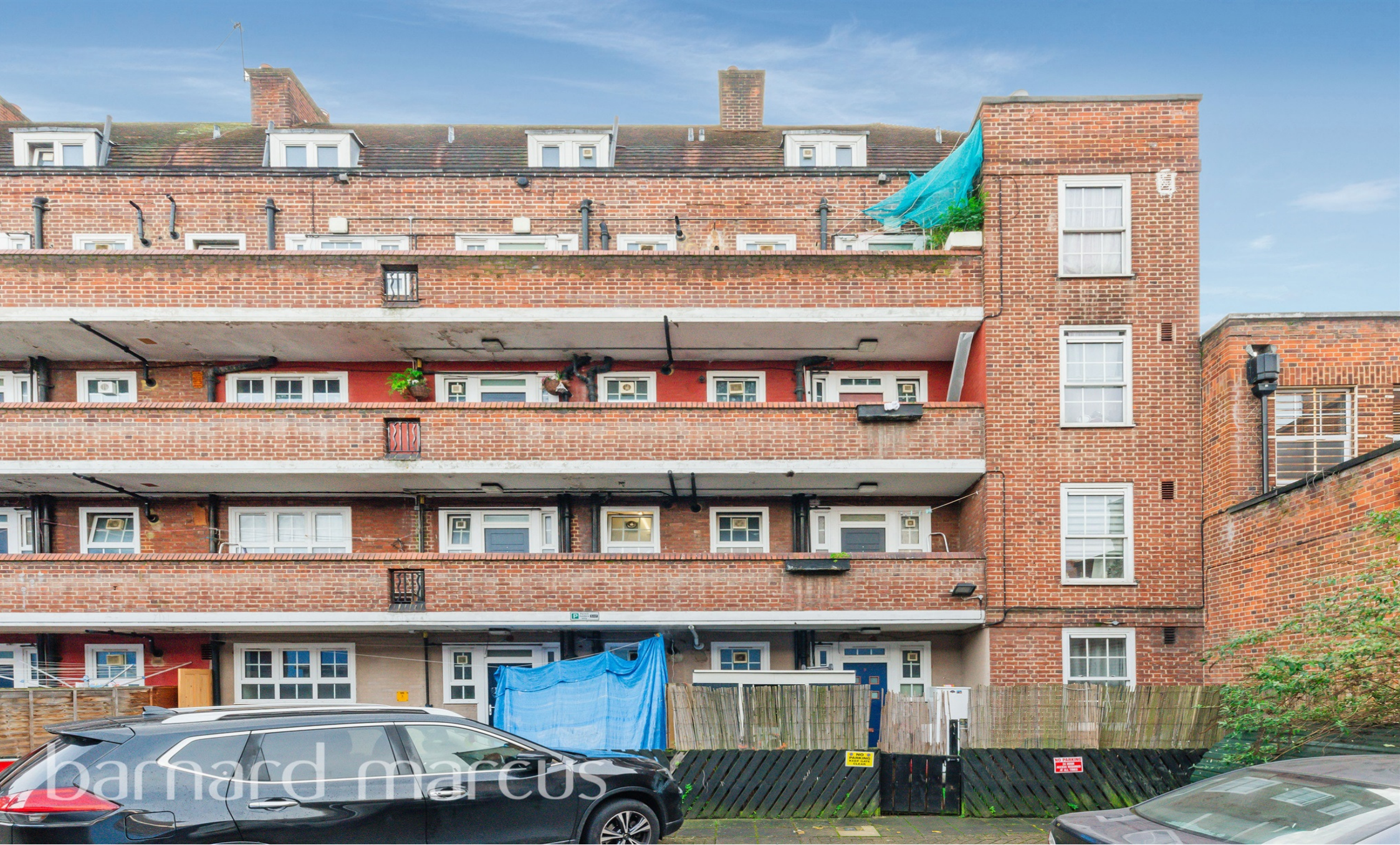
Stanmore House Union Grove, London SW8 2QT