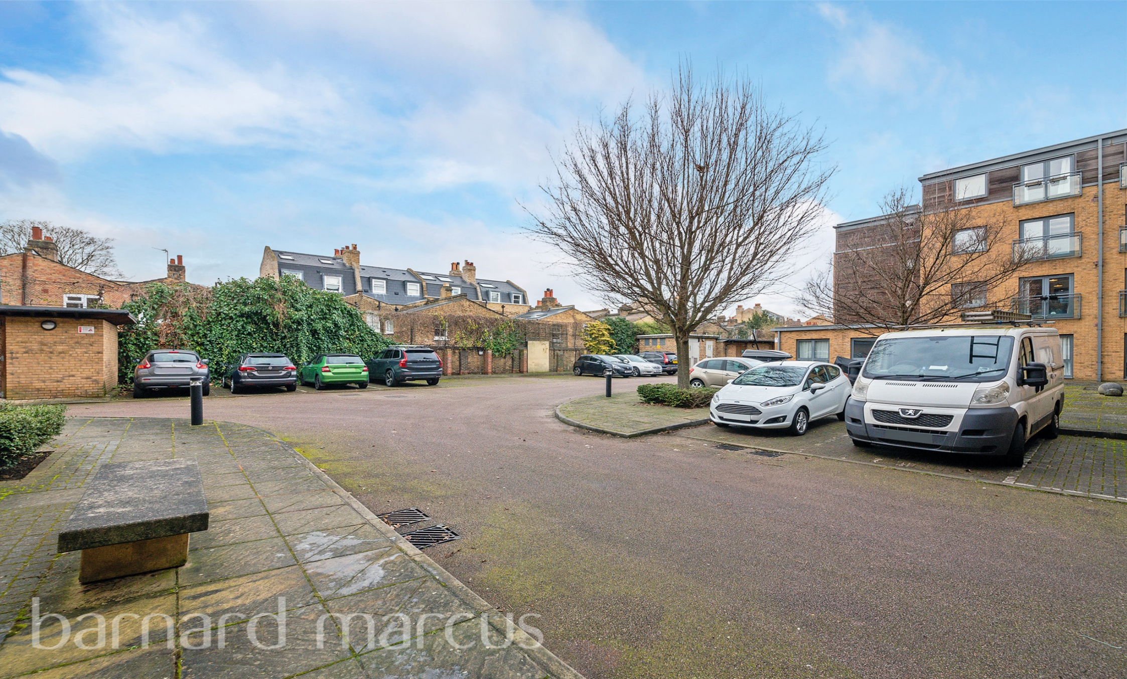
Effra Parade, London SW2 1PG