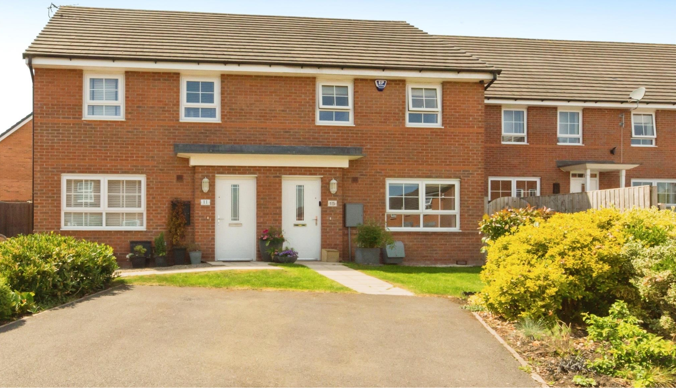
Yellowhammer Crescent, Winsford CW7 4FL