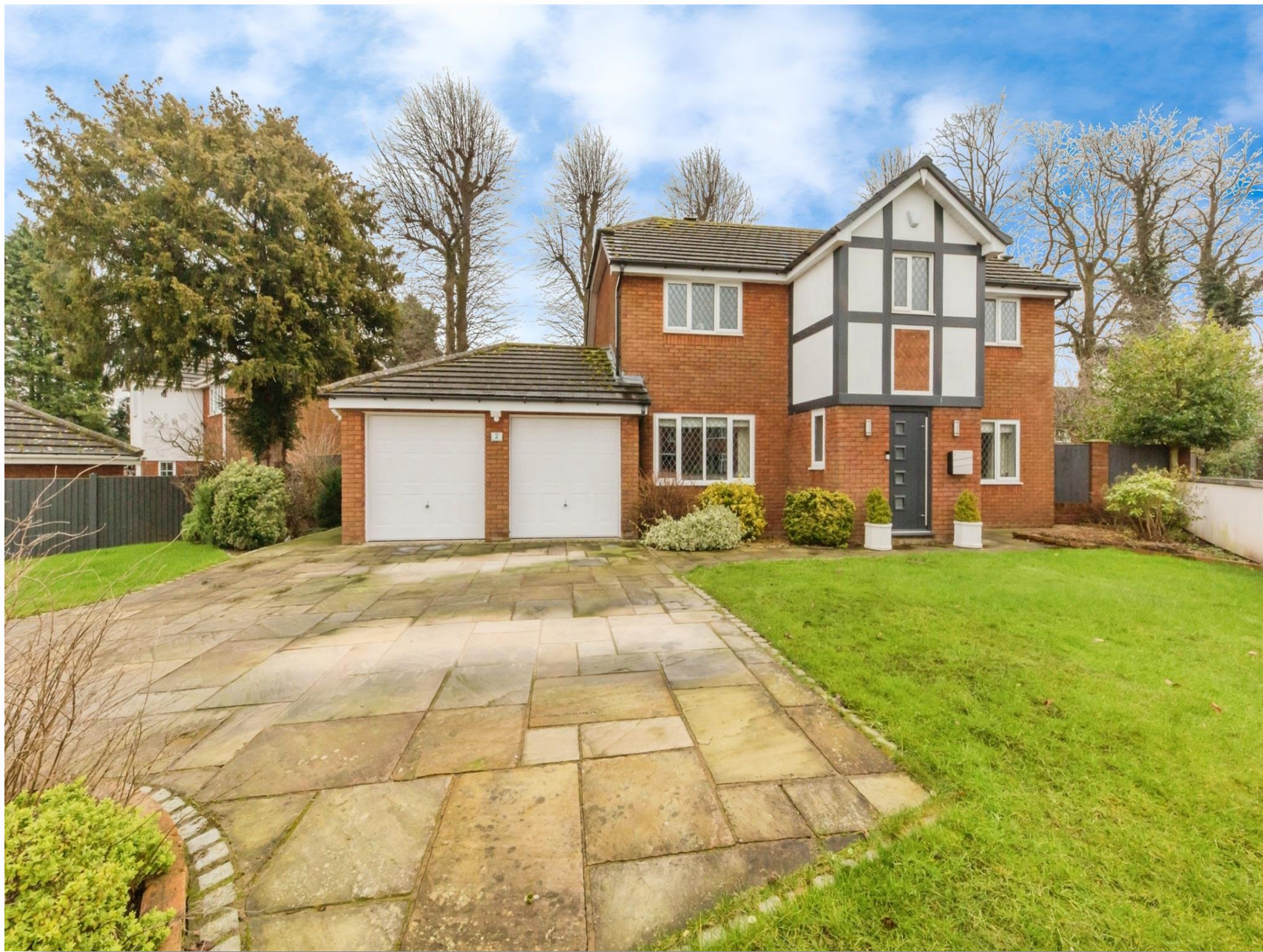
The Loont, Winsford CW7 1EU