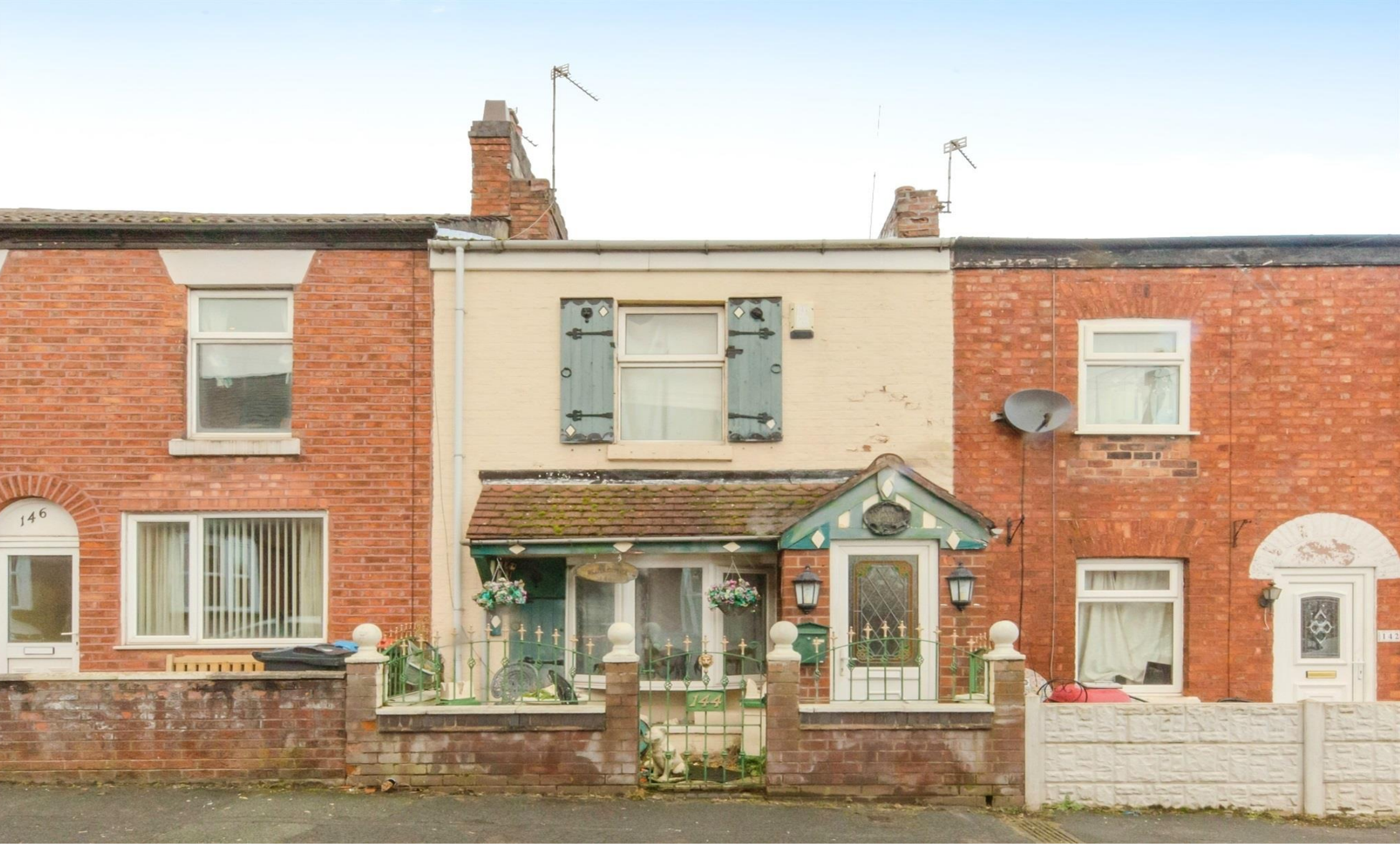
Weaver Street, Winsford CW7 4AE