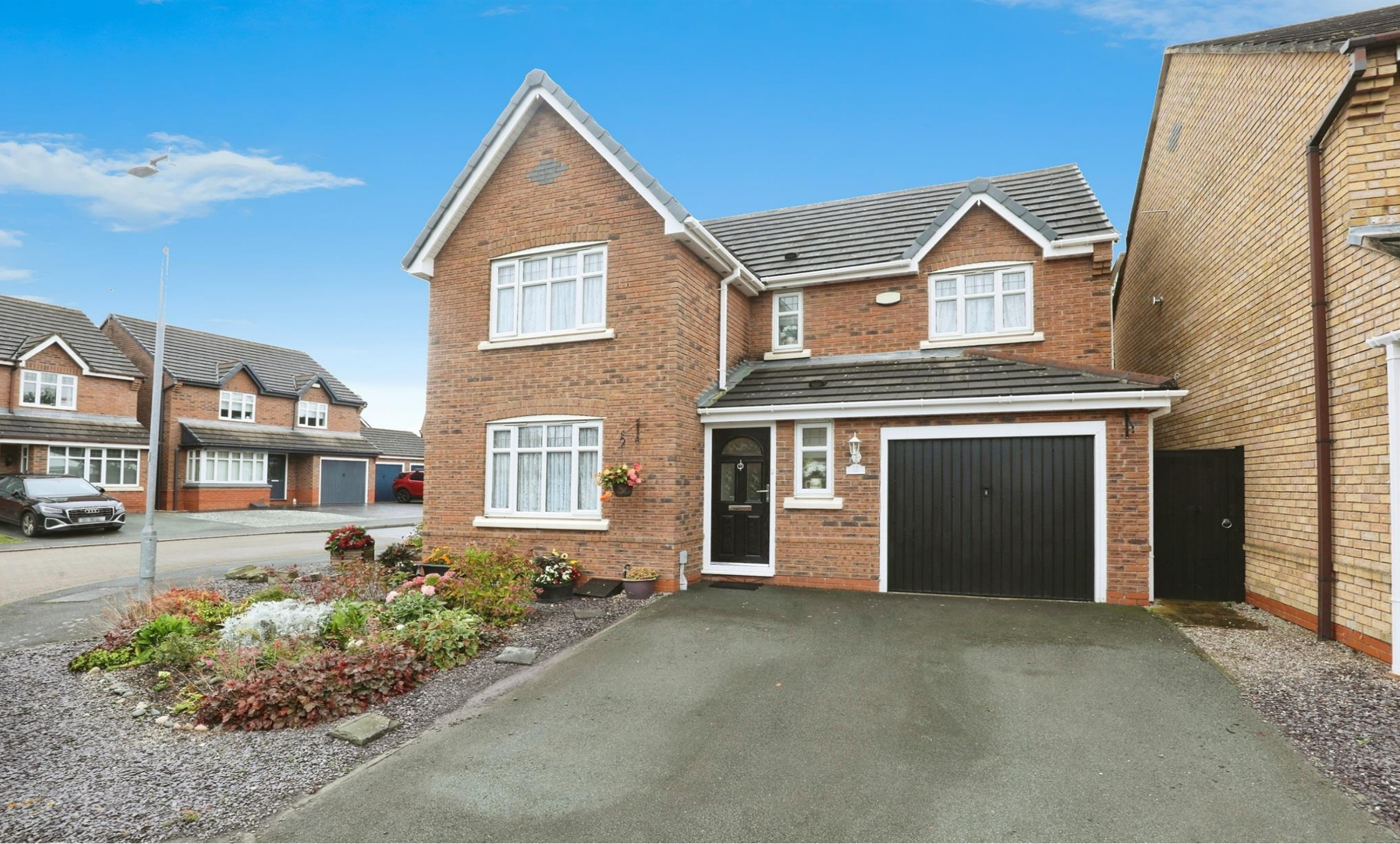
Hartwell Grove, Winsford CW7 3UR