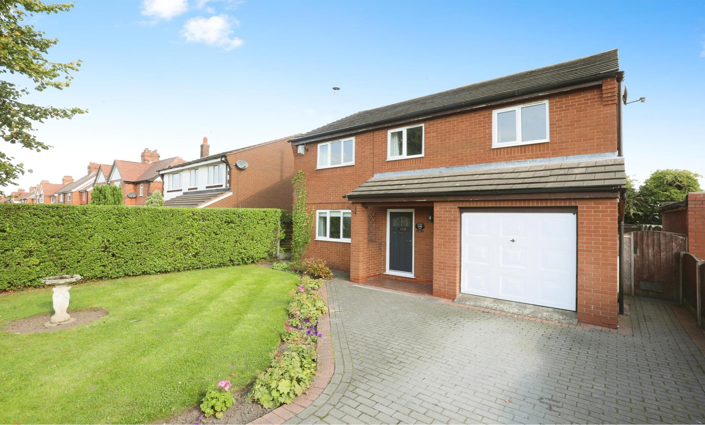
Grange Lane, Winsford CW7 2BS