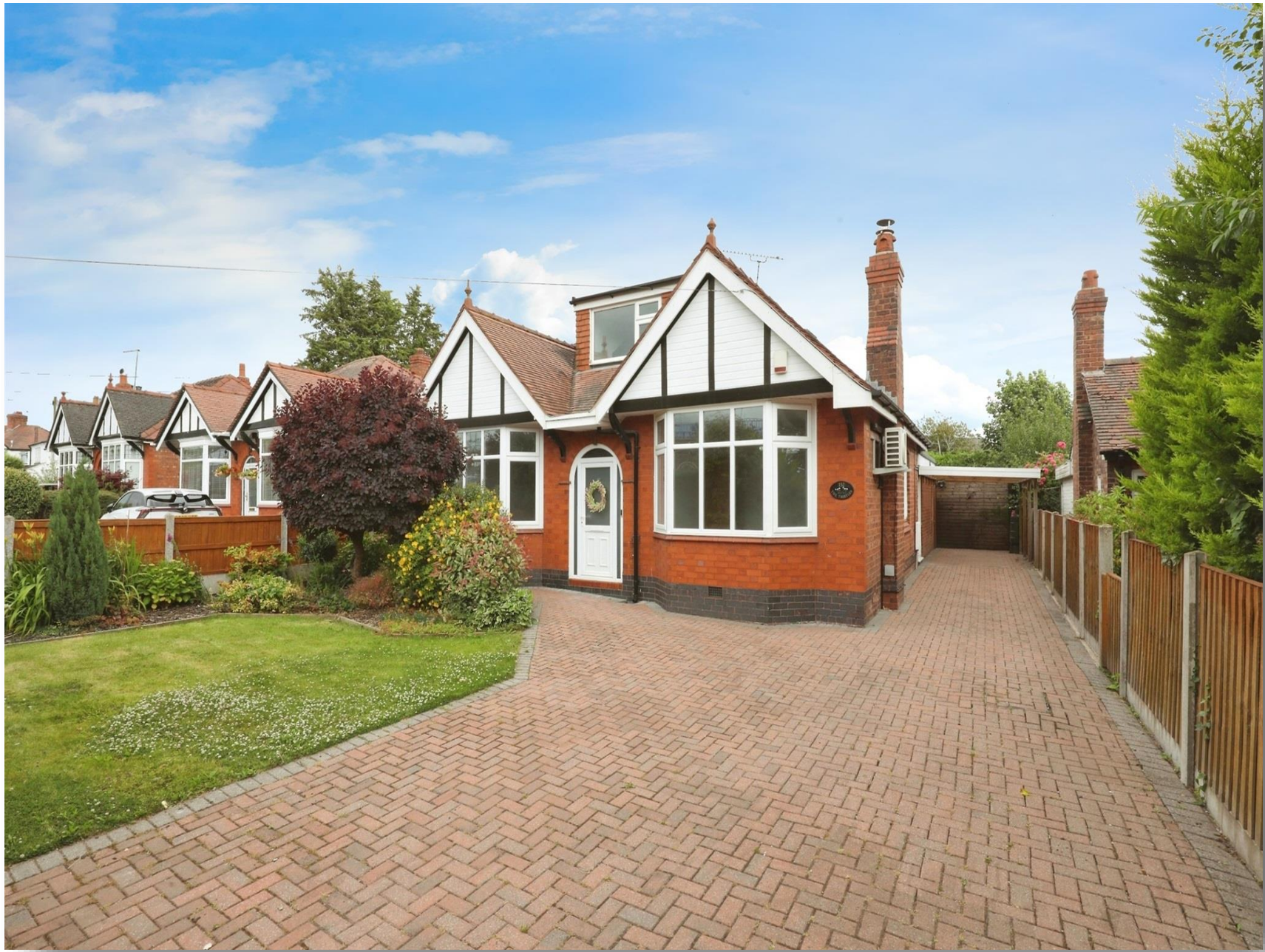
Wharton Road, Winsford CW7 3AH