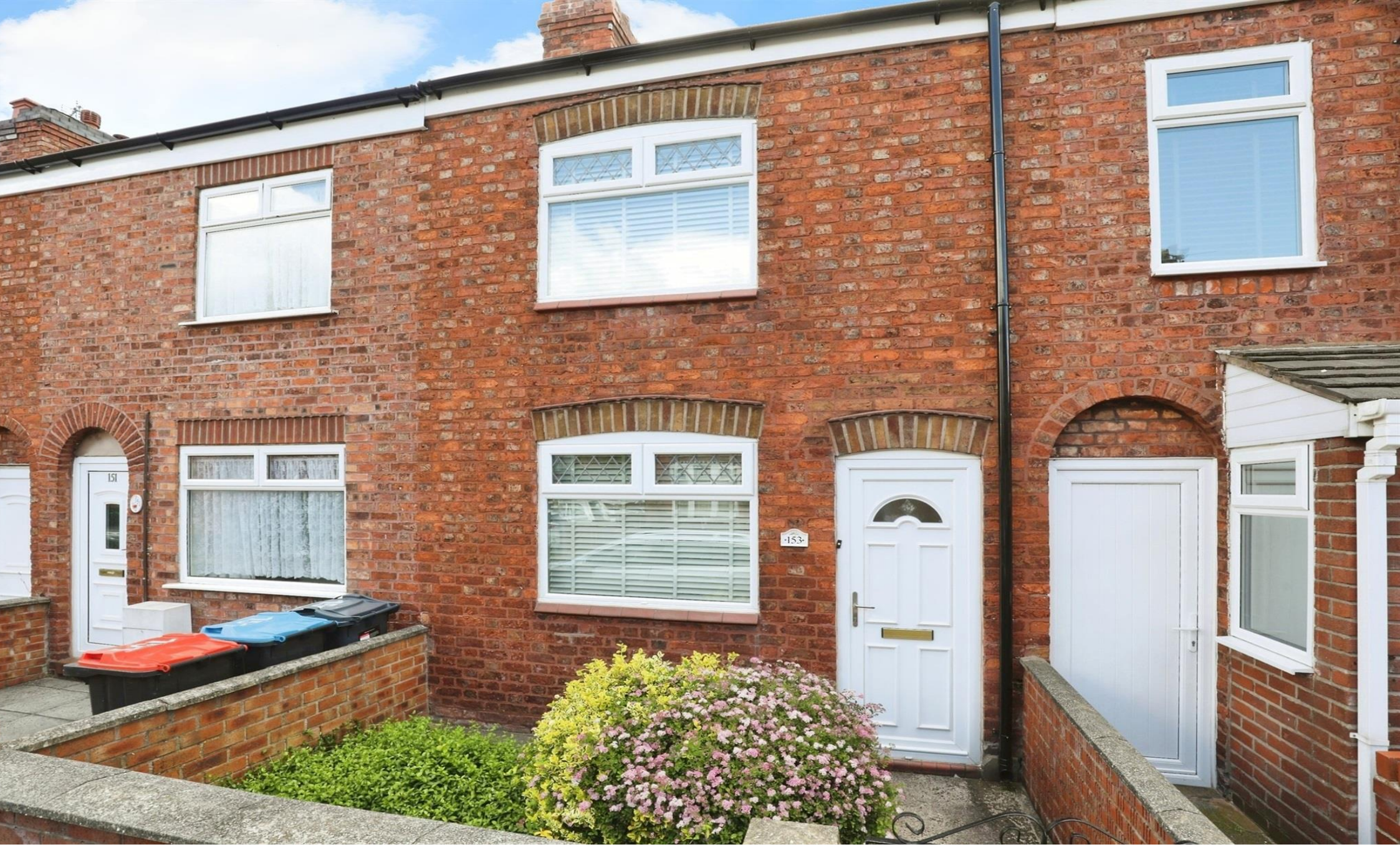
Dingle Lane, Winsford CW7 1AA