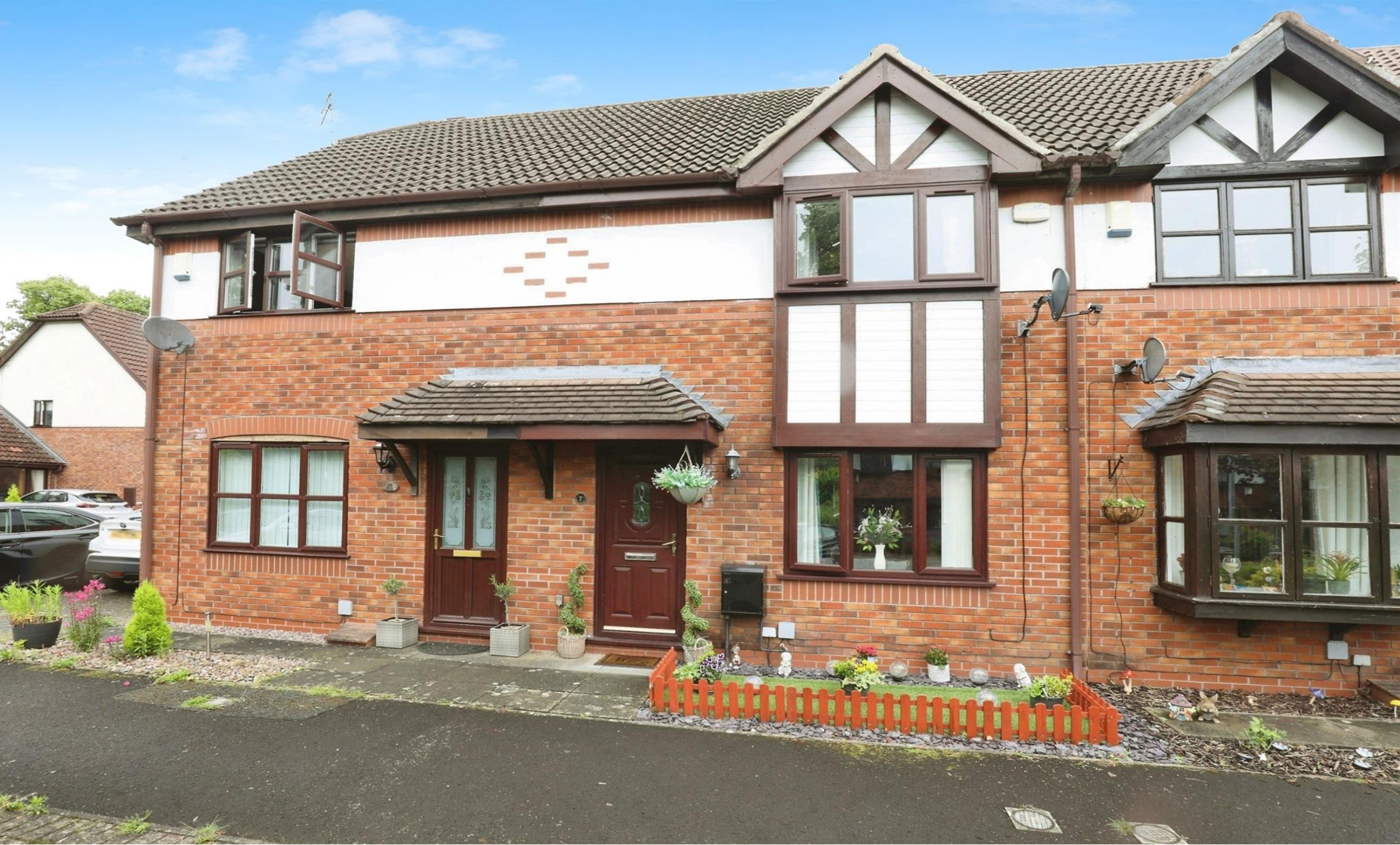
Blenheim Gardens, Winsford CW7 1FD