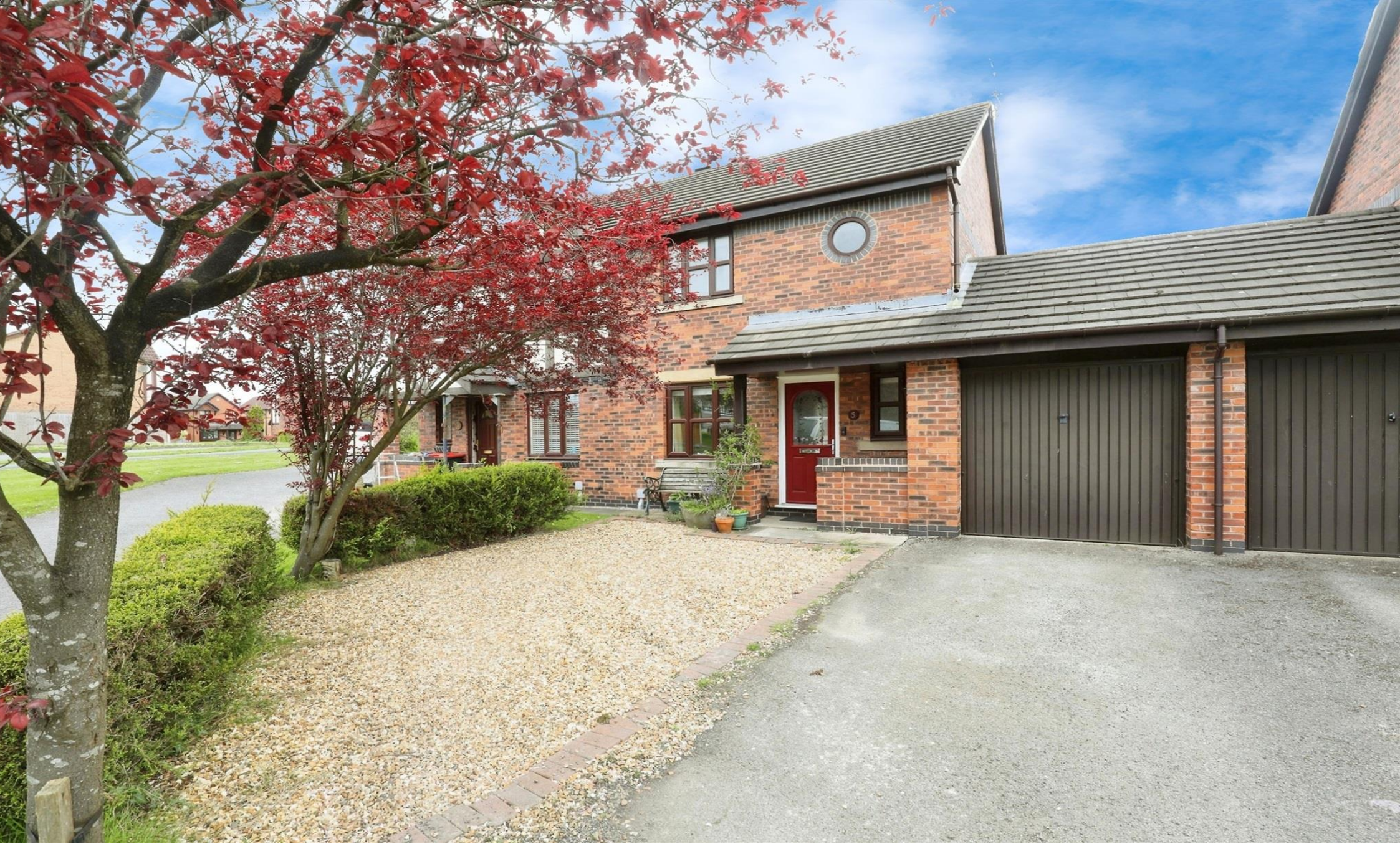
Rookery Rise, Winsford CW7 3EA