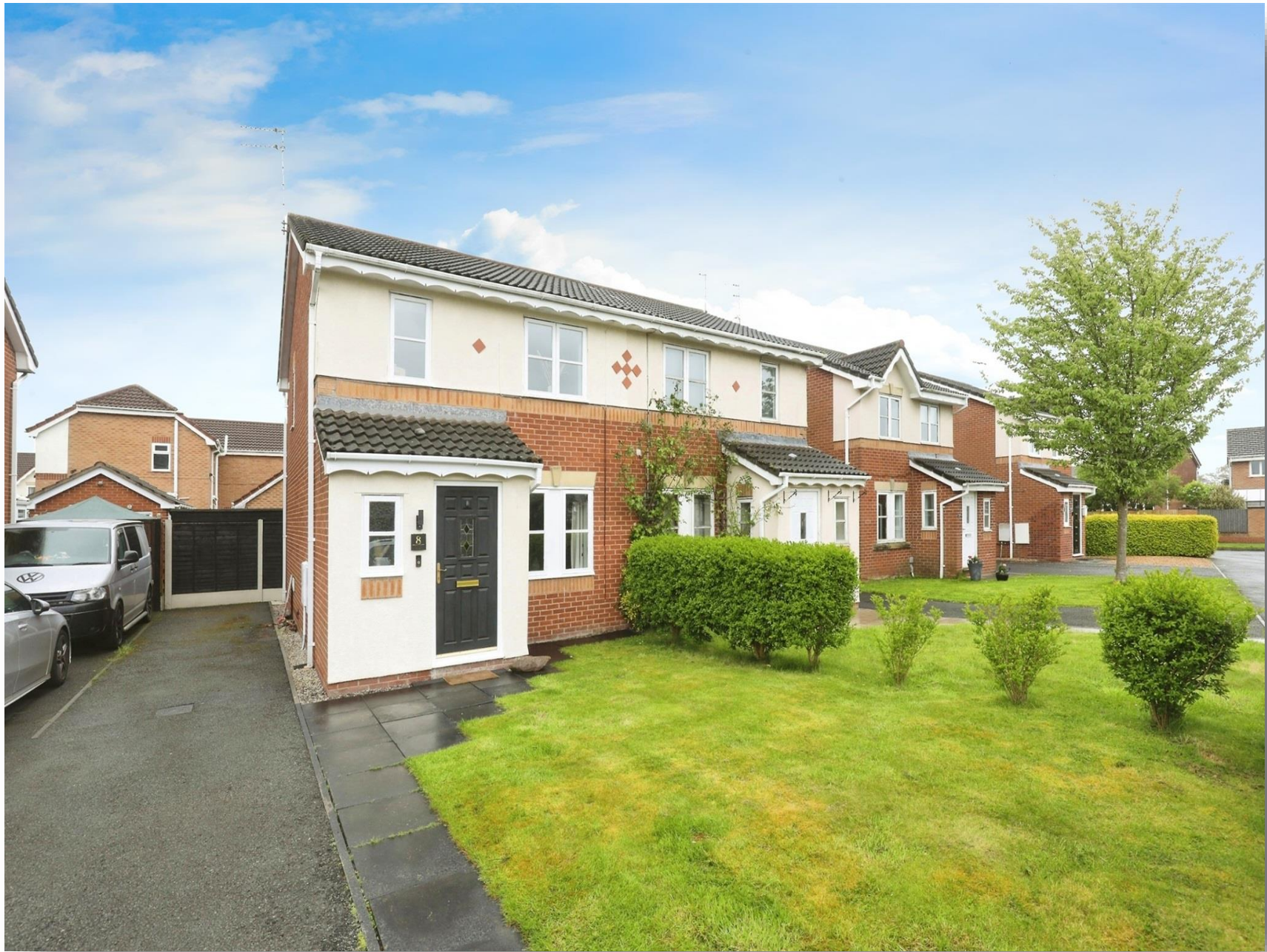
Pinetree Close, Winsford CW7 3FR