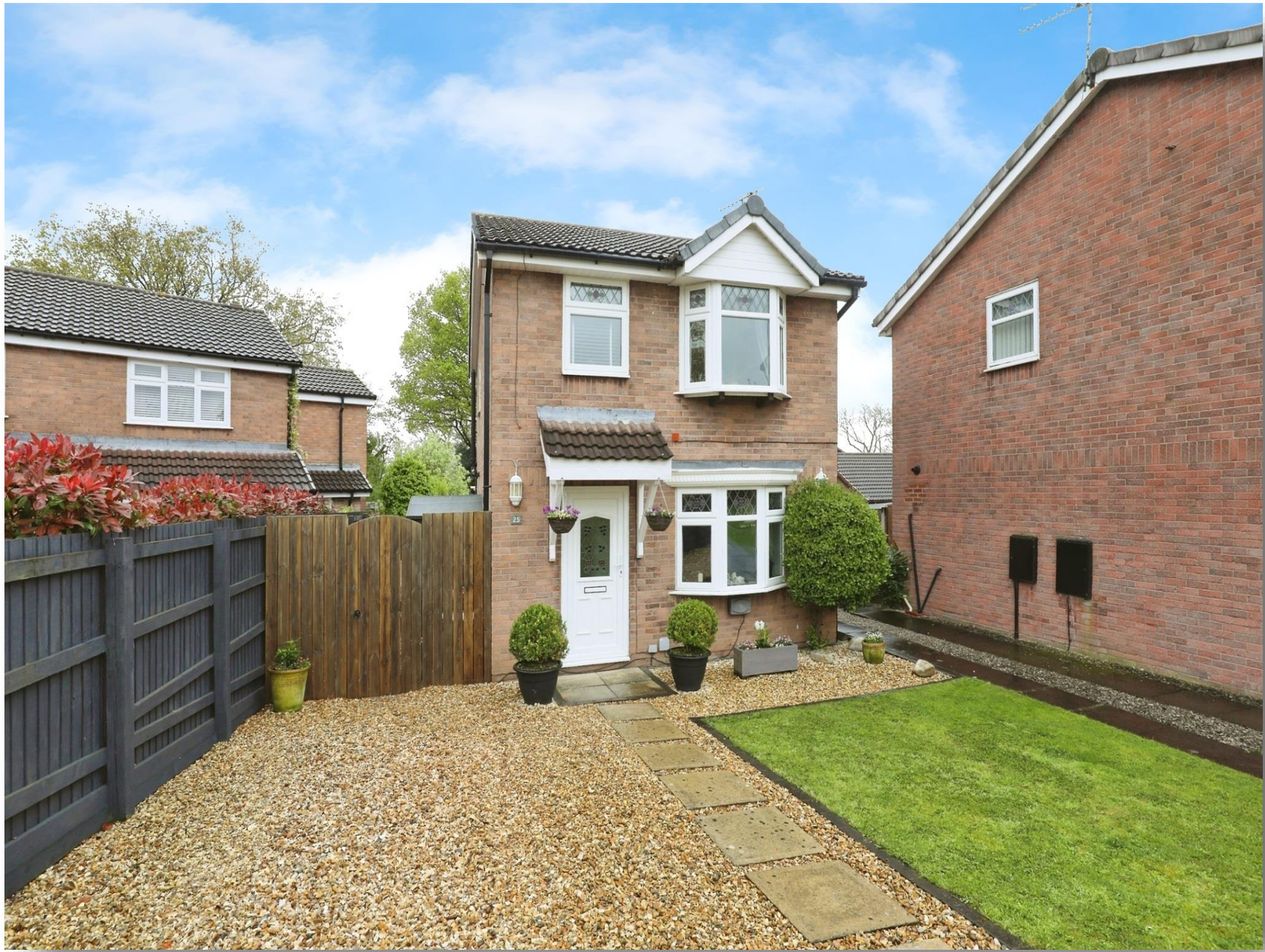
Knights Meadow, Winsford CW7 2DL