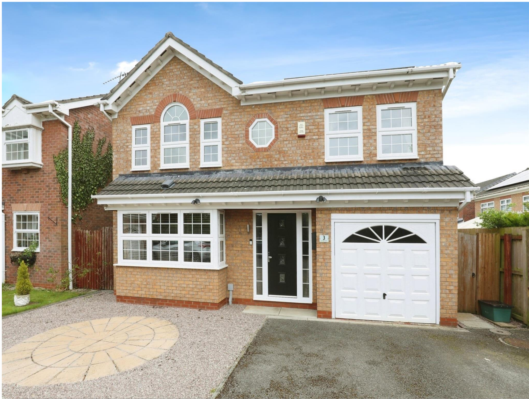
Vicarage Grove, Winsford CW7 1SZ