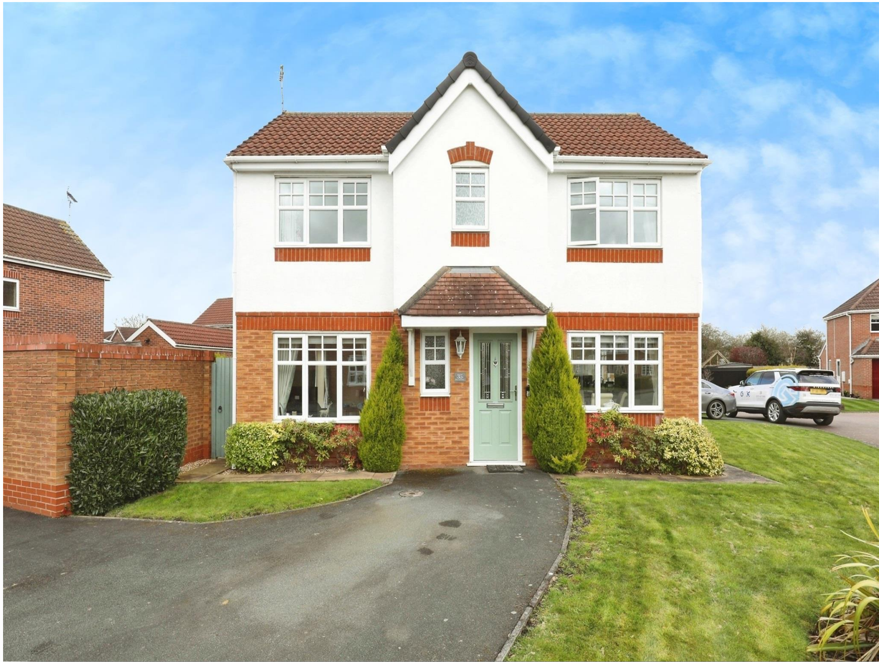
Rosewood Drive, Winsford CW7 2UZ