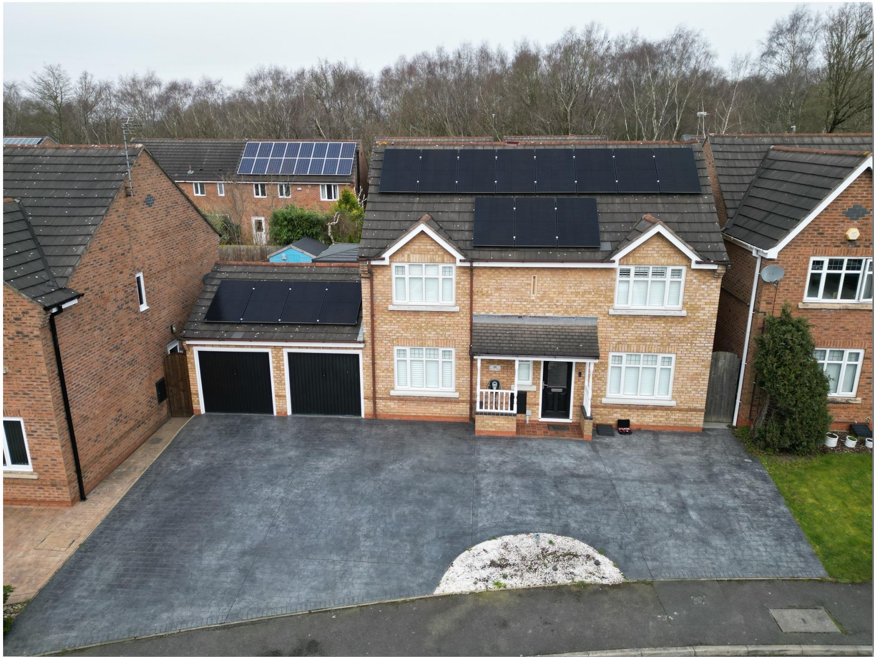
Hartwell Grove, Winsford CW7 3UR