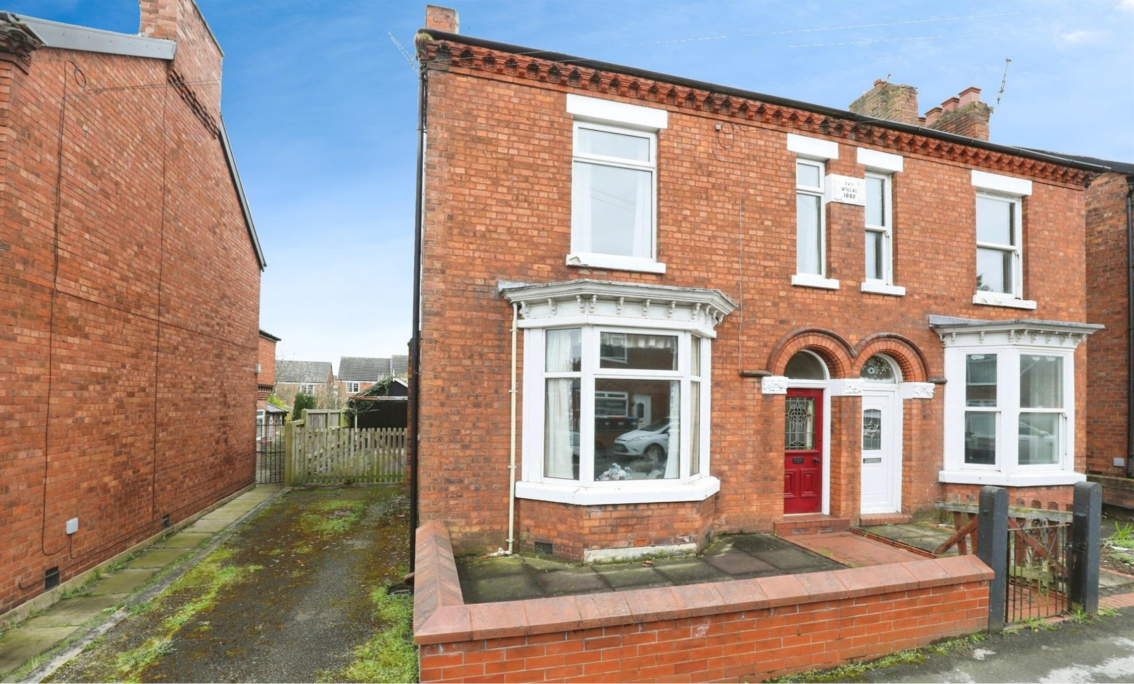
Weaver Street, Winsford CW7 4AJ