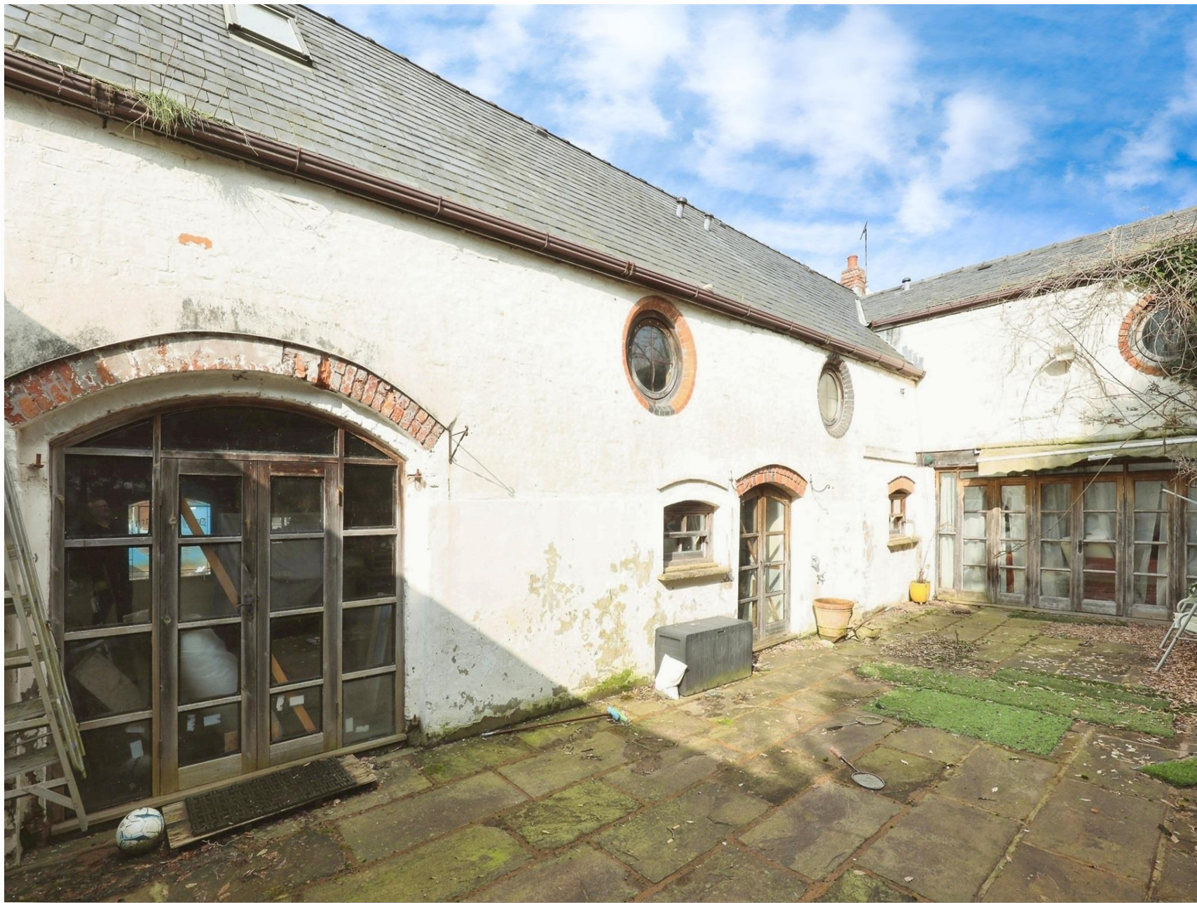
Dairy House Farm Clive Lane, Winsford CW7 3PA