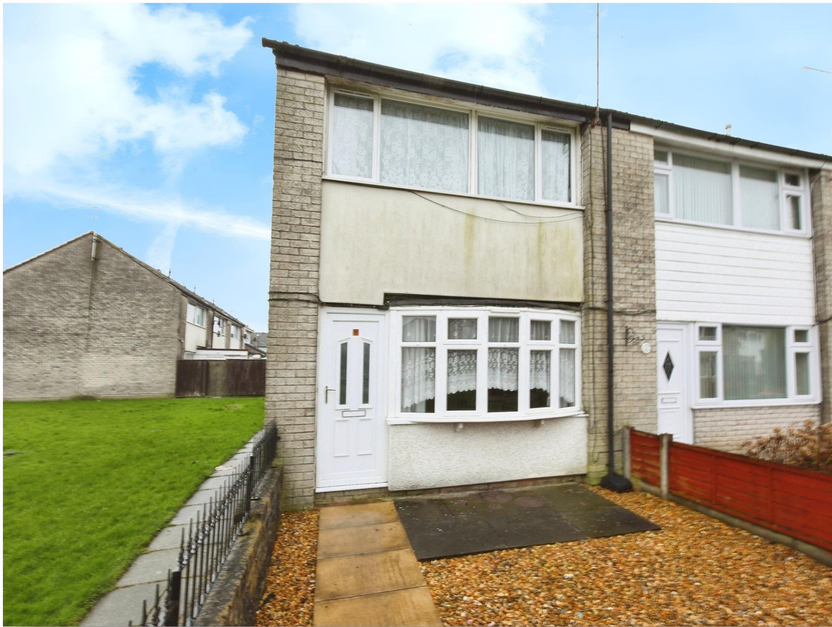
Dee Way, Winsford CW7 3JB