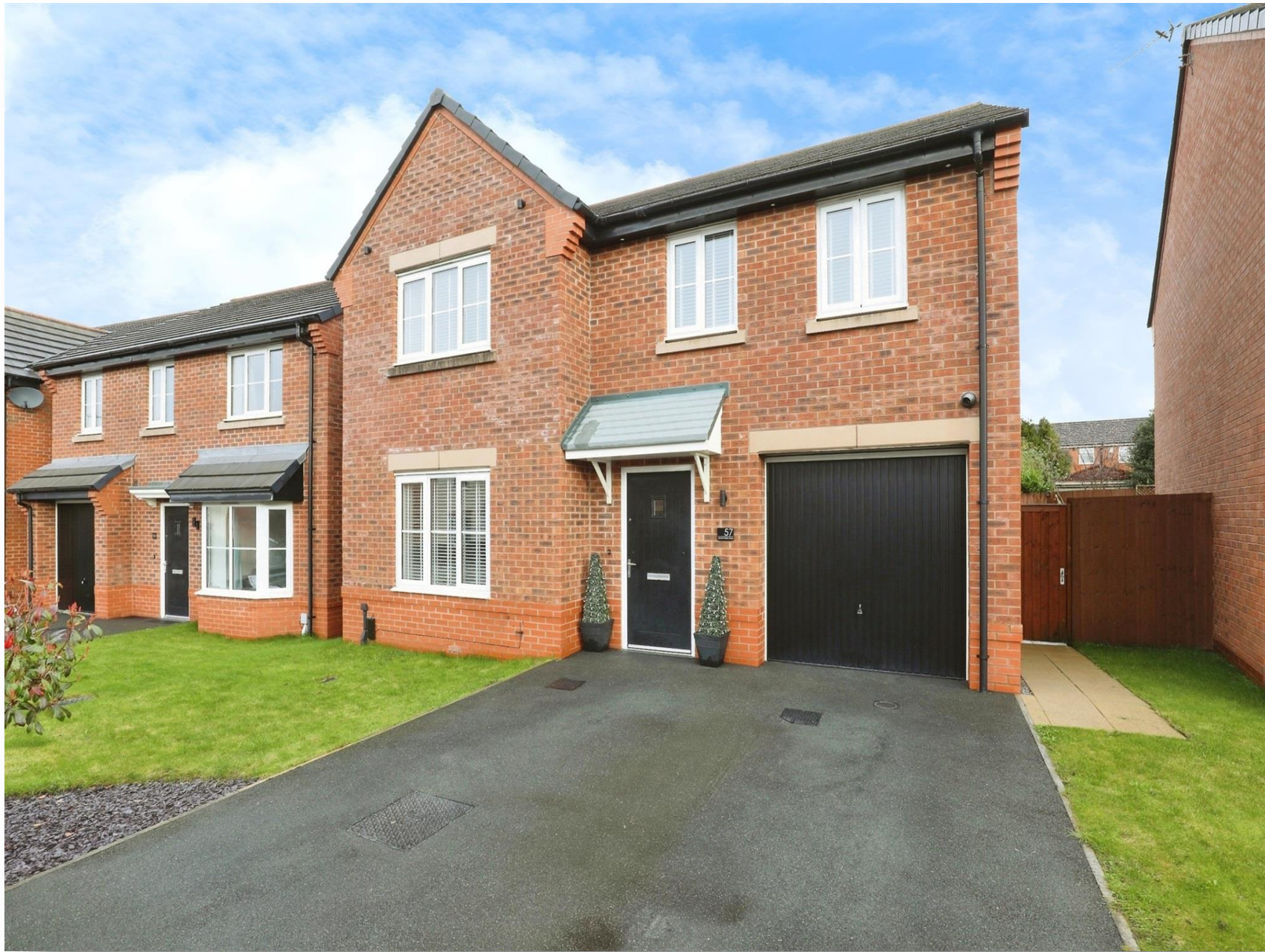
James Clarke Road, Winsford CW7 2GT