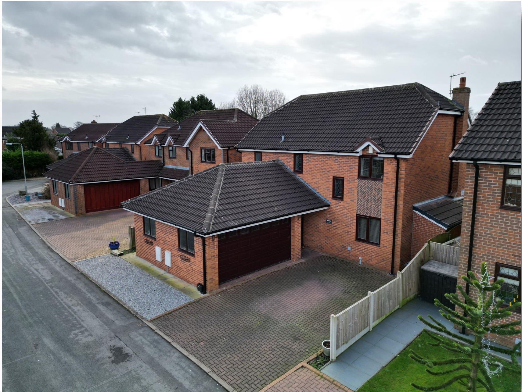
Swallow Court, Winsford CW7 1SR