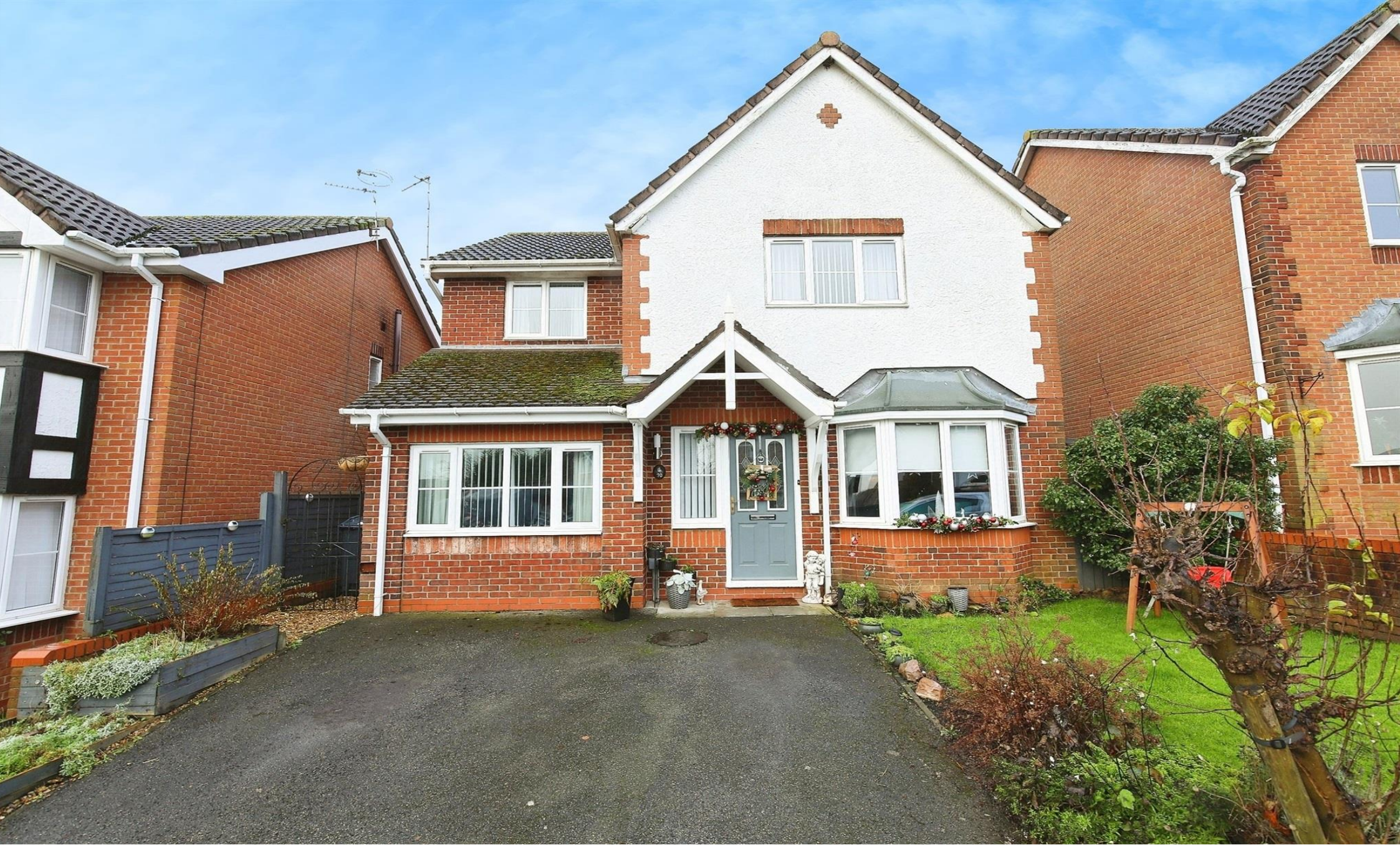
Birkdale Gardens, Winsford CW7 2LE