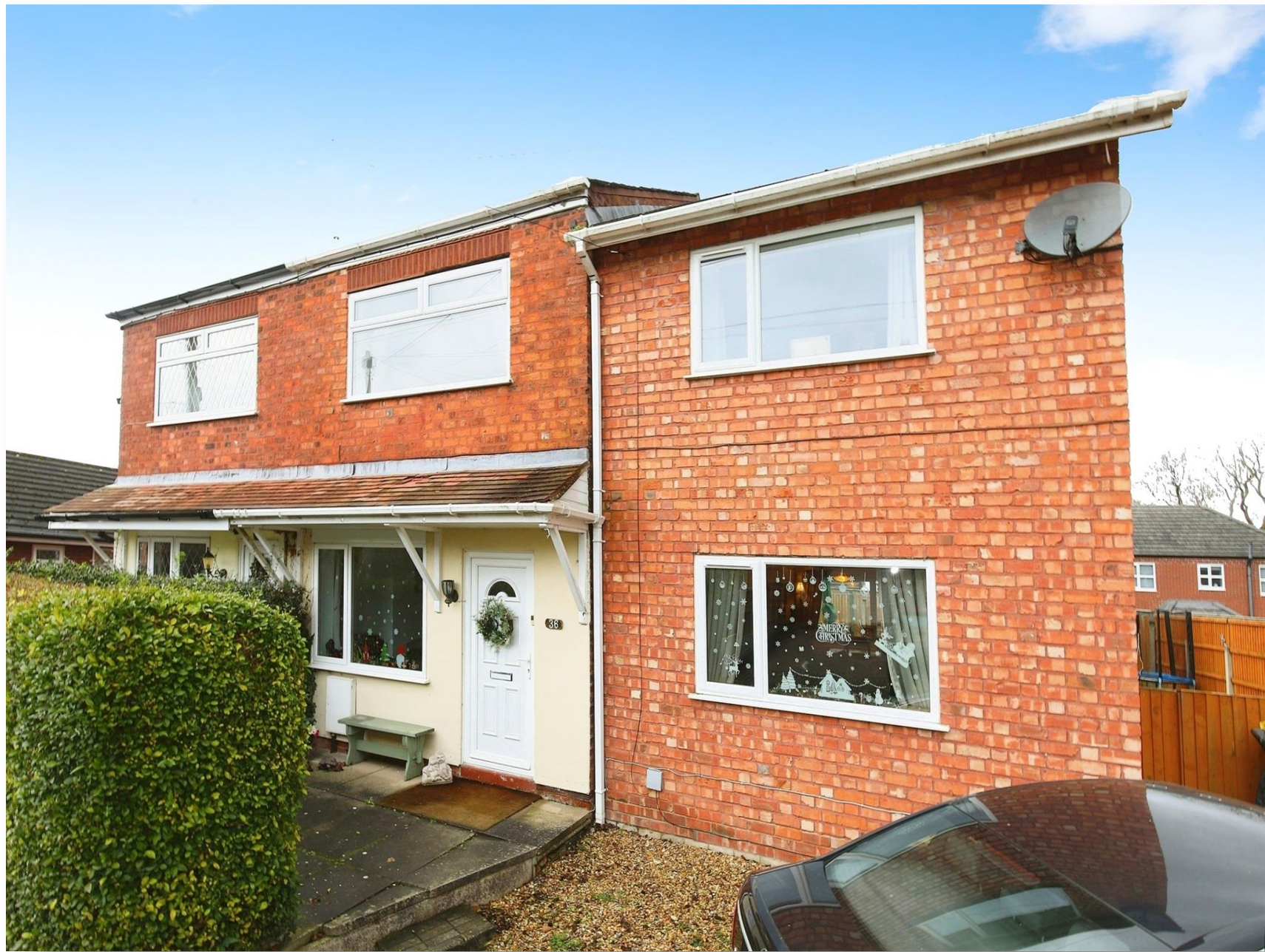
Littler Lane, Winsford CW7 2NF