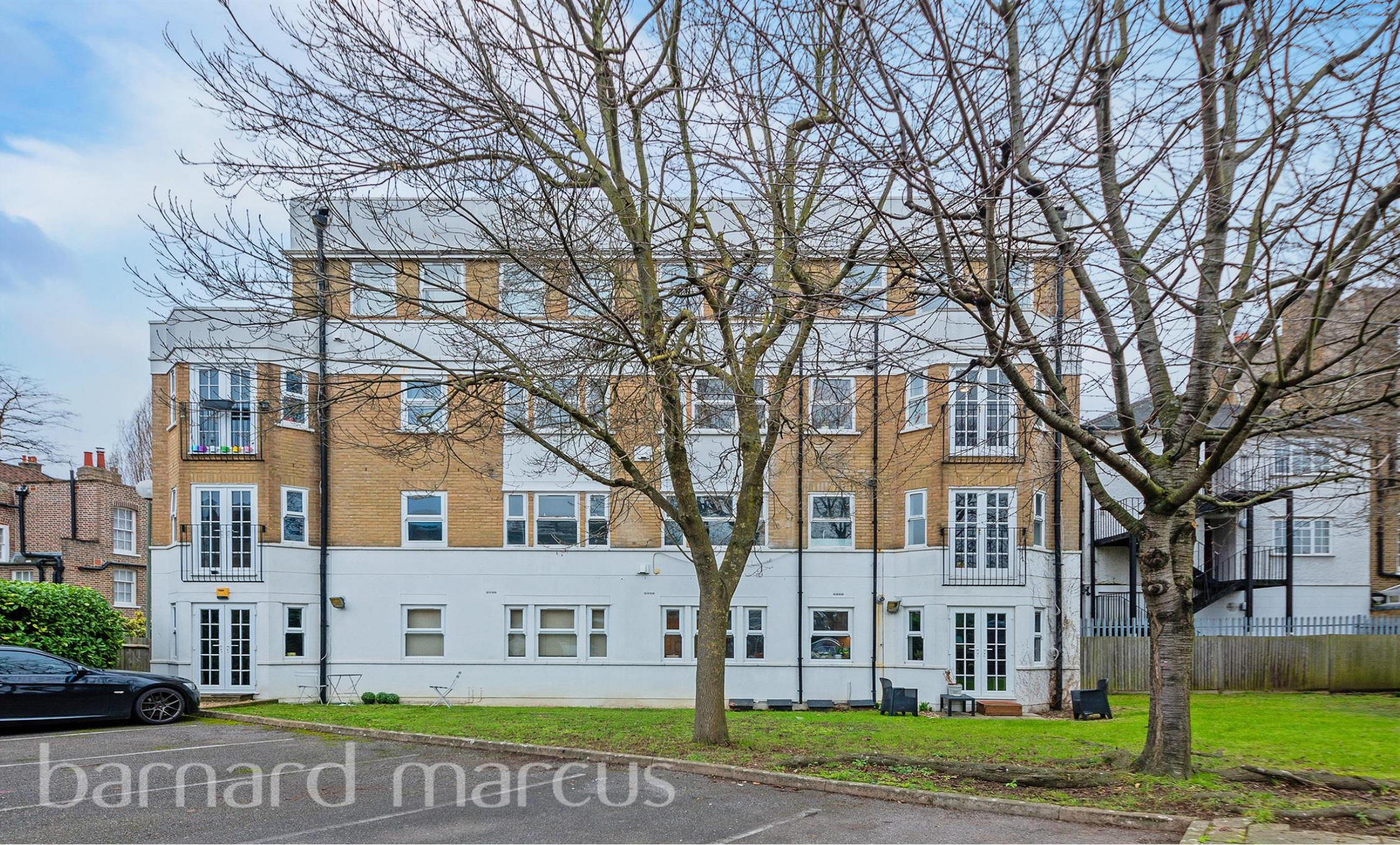
Park Mansions, Stamford Brook Avenue, London, W6 0YD