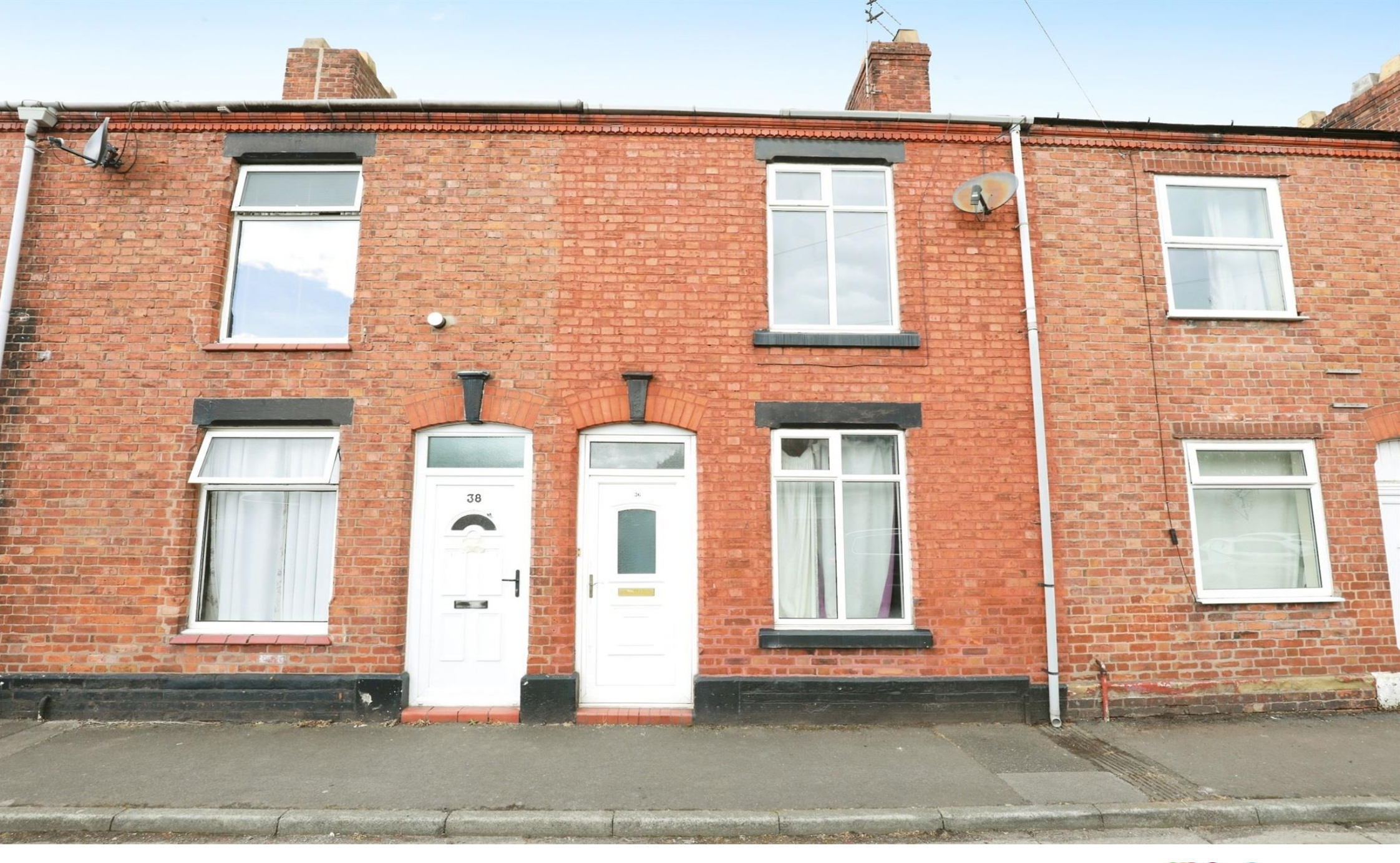
Chapel Street, Northwich CW8 1HD