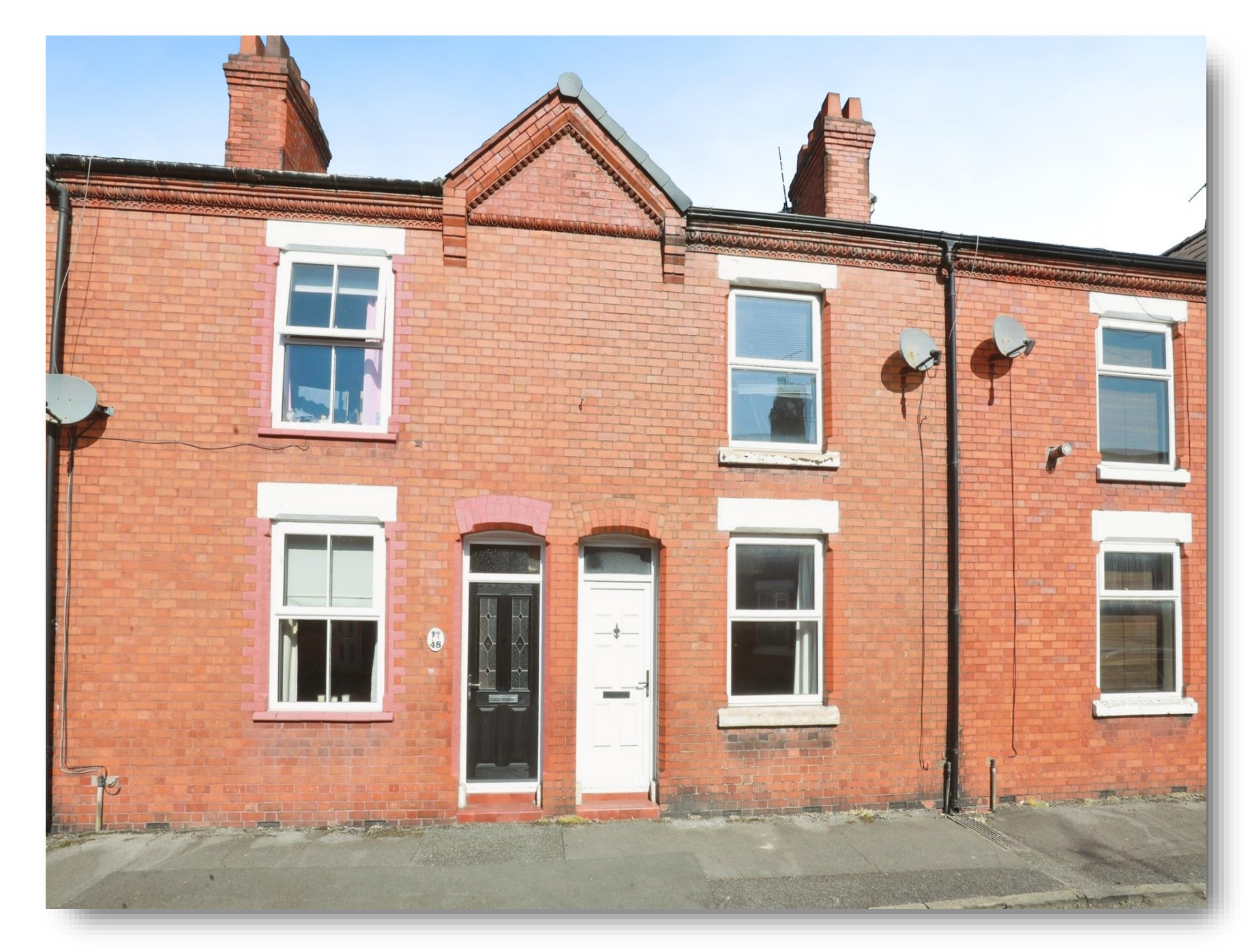
Huxley Street, Northwich CW8 1DD