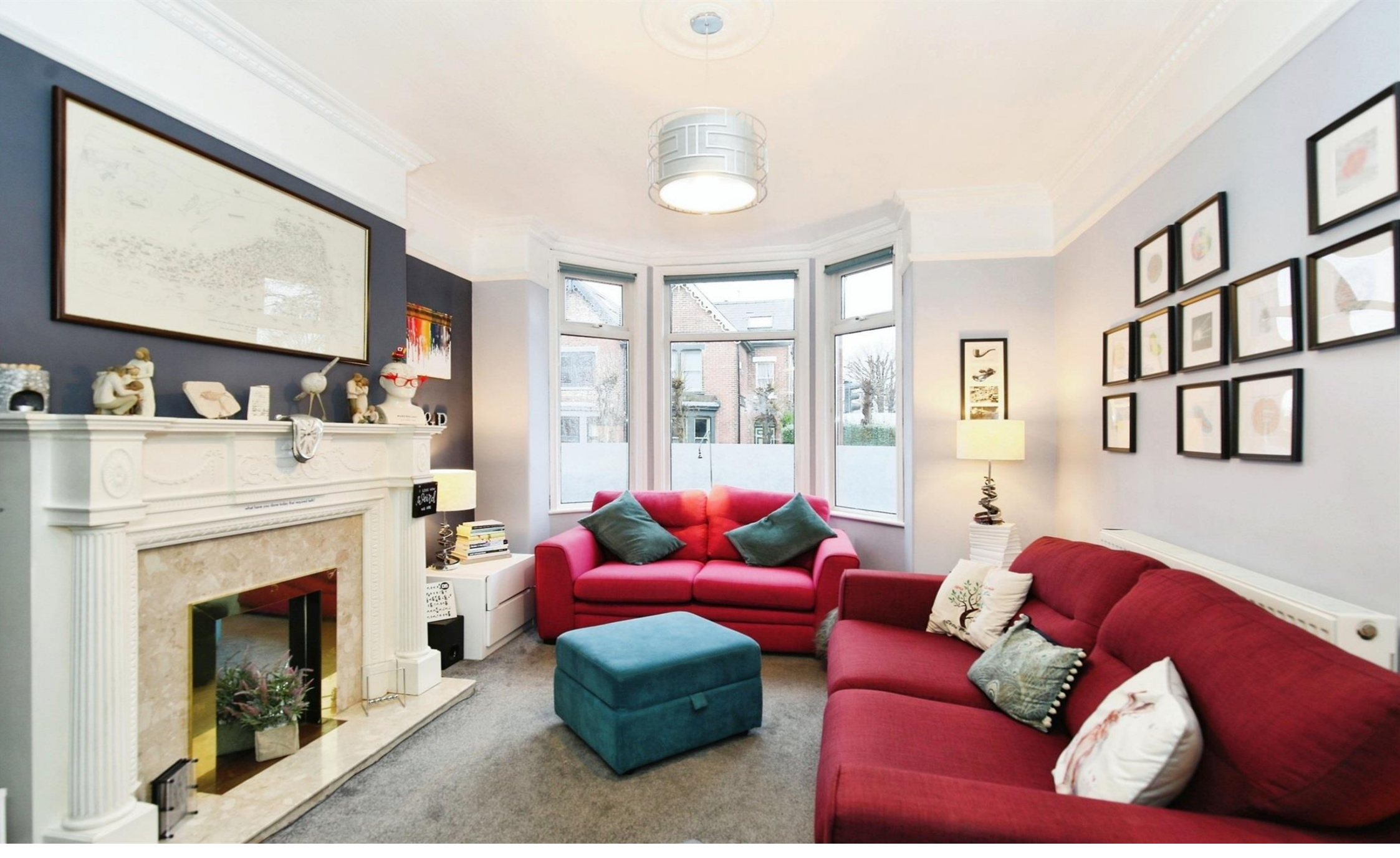
Winnington Lane, Northwich CW8 4DE