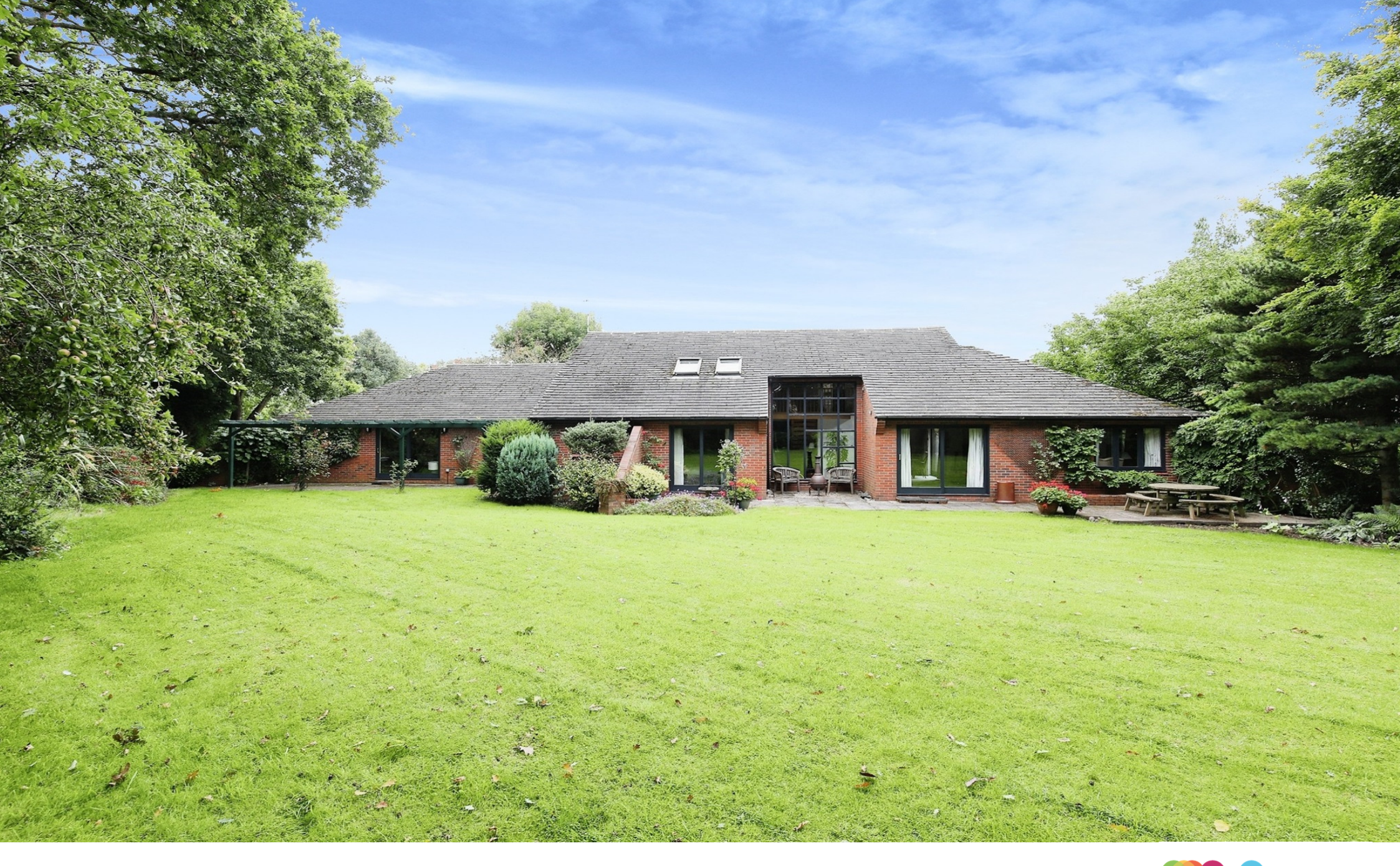
The Paddock Eaglesfield, Hartford Northwich CW8 1NQ