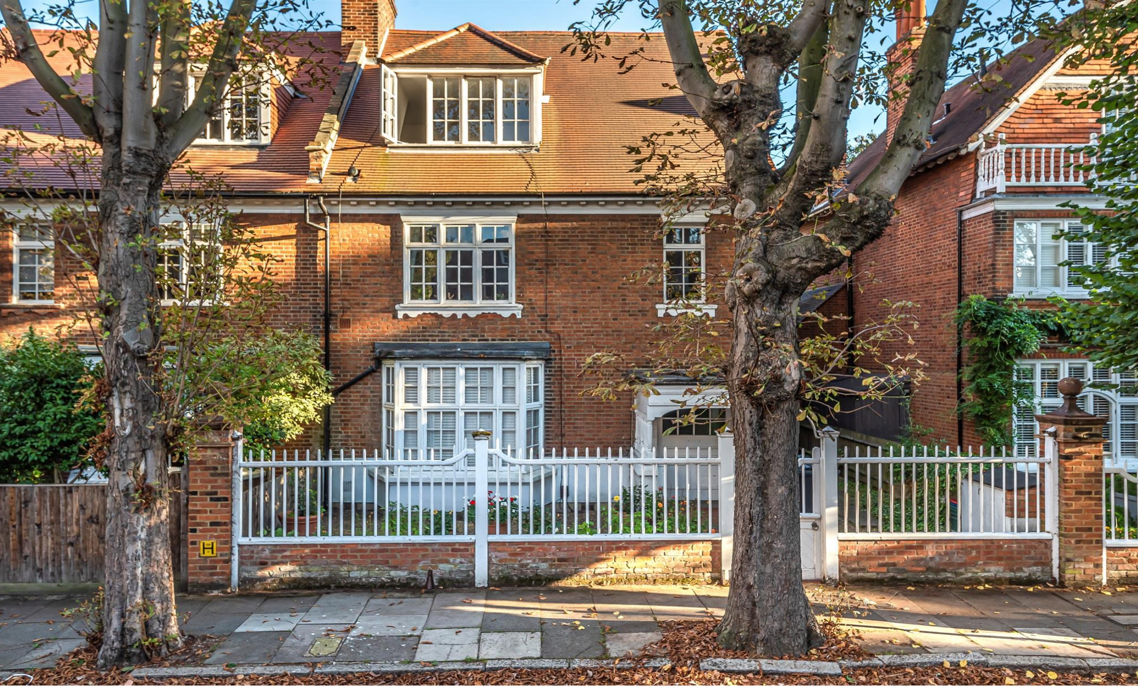
Addison Grove, London W4 1ER