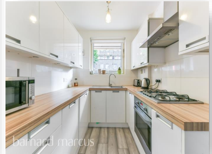
Pitt House, Maysoule Road London SW11 2BT