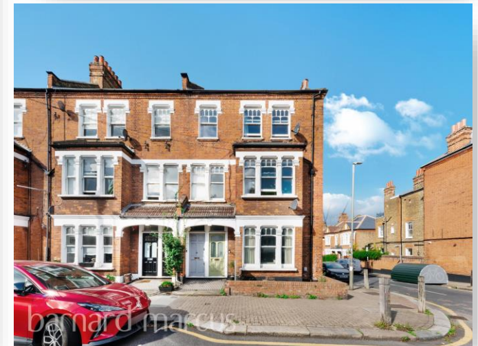
Lavender Sweep, London SW11 1HD