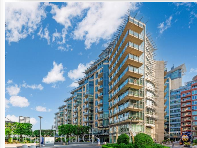
Kingfisher House, Juniper Drive, London SW18 1TY