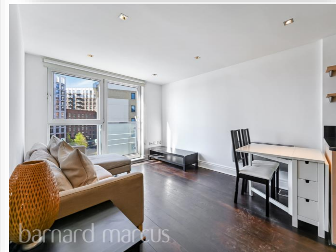
Omega Building, Smugglers Way, London SW18 1AZ