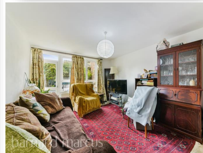
Wolfencroft Close, London SW11 2LB