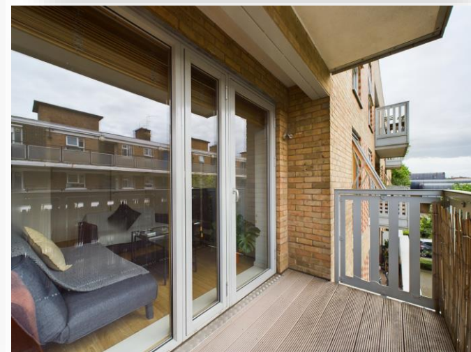
Chadwick House, Latchmere Street, London SW11 5JR