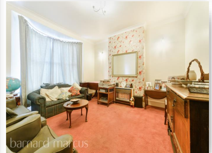
Eland Road, London SW11 5JY