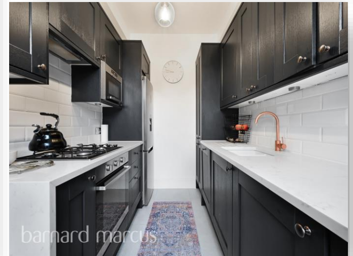
St James Terrace, London SW12 8HJ