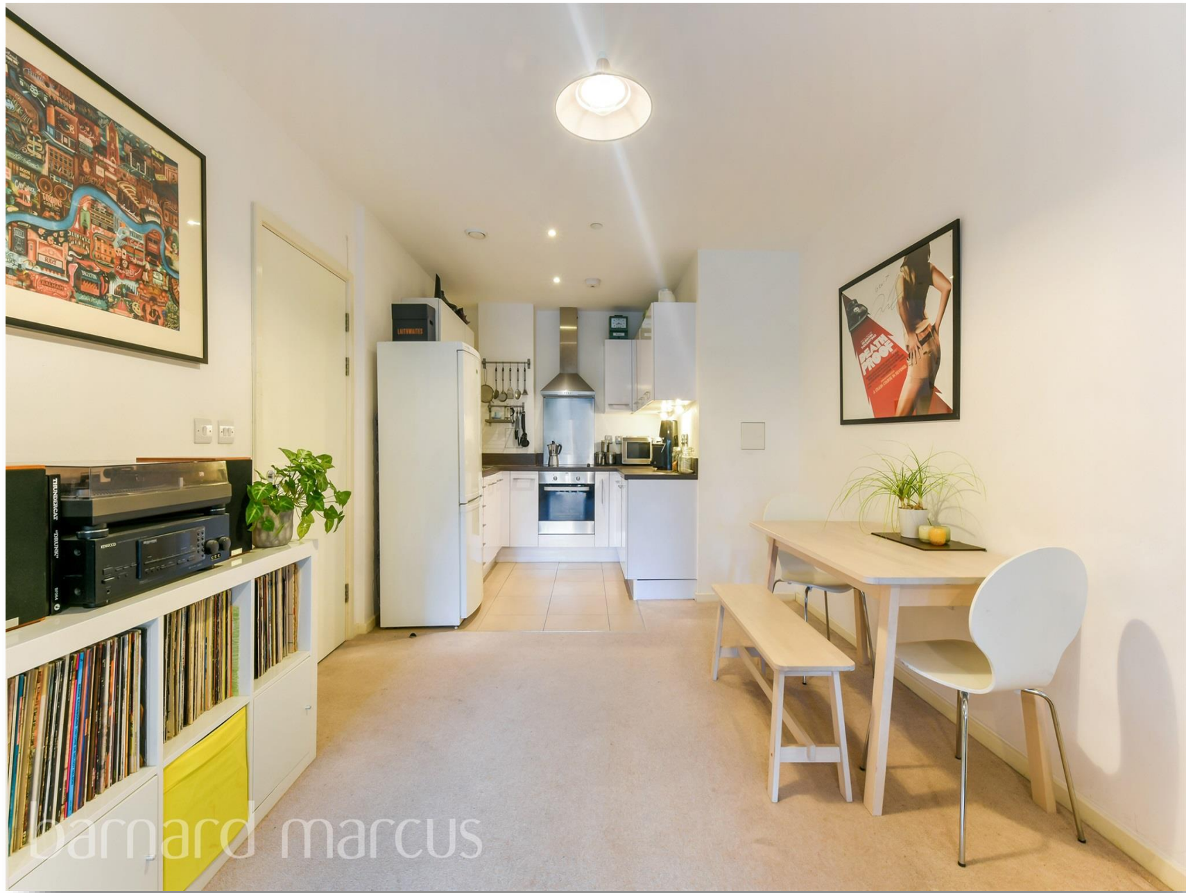
Flotilla House, Juniper Drive London SW18 1FX