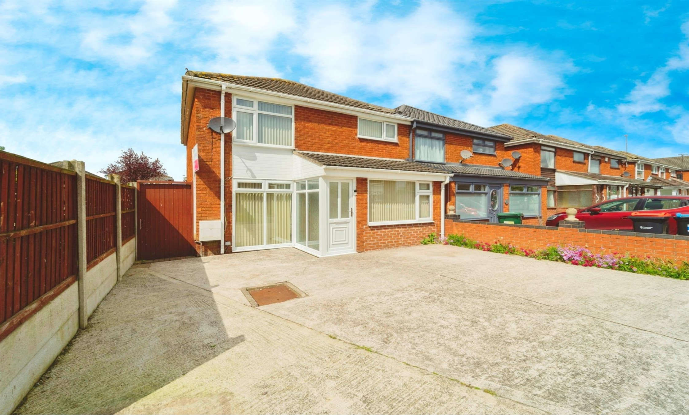
Alvanley View, Elton CH2 4QD