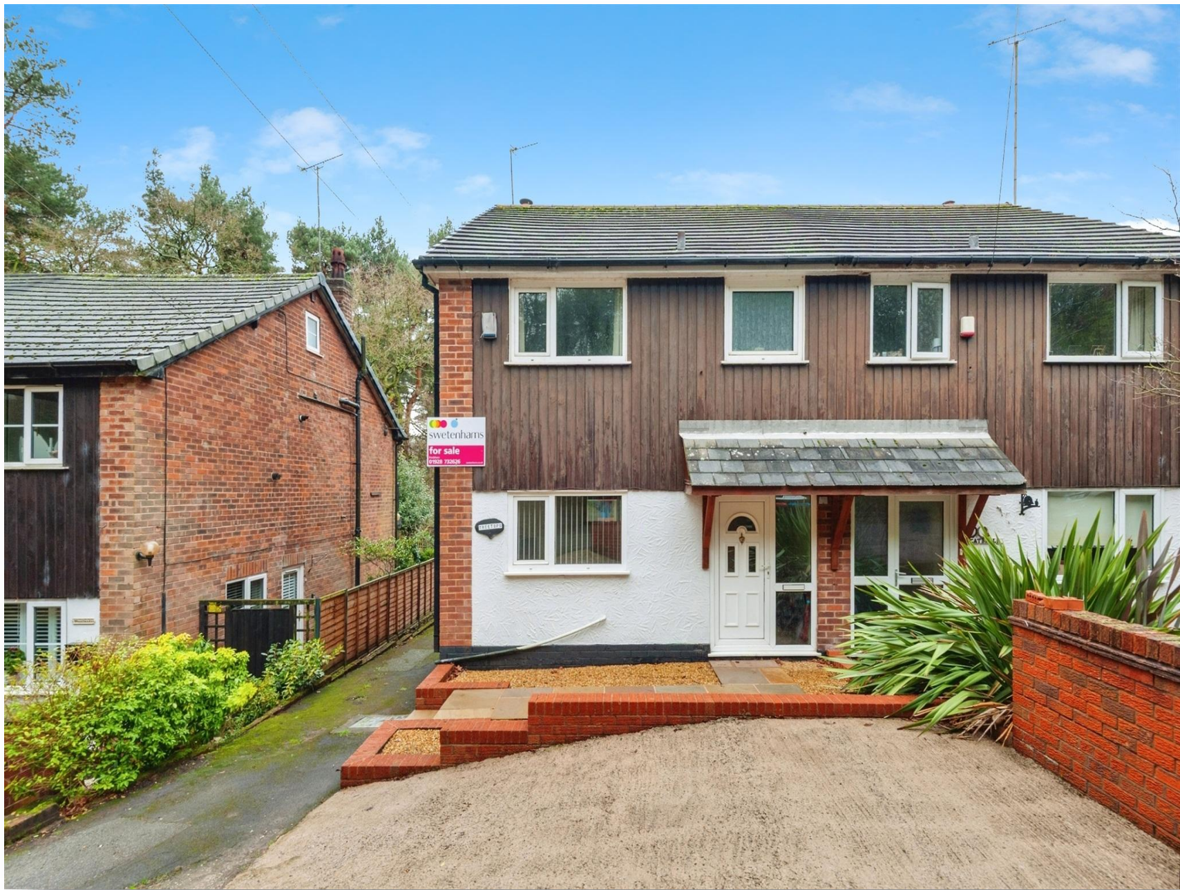
Tree-Tops Blakemere Lane, Norley Frodsham WA6 6NS